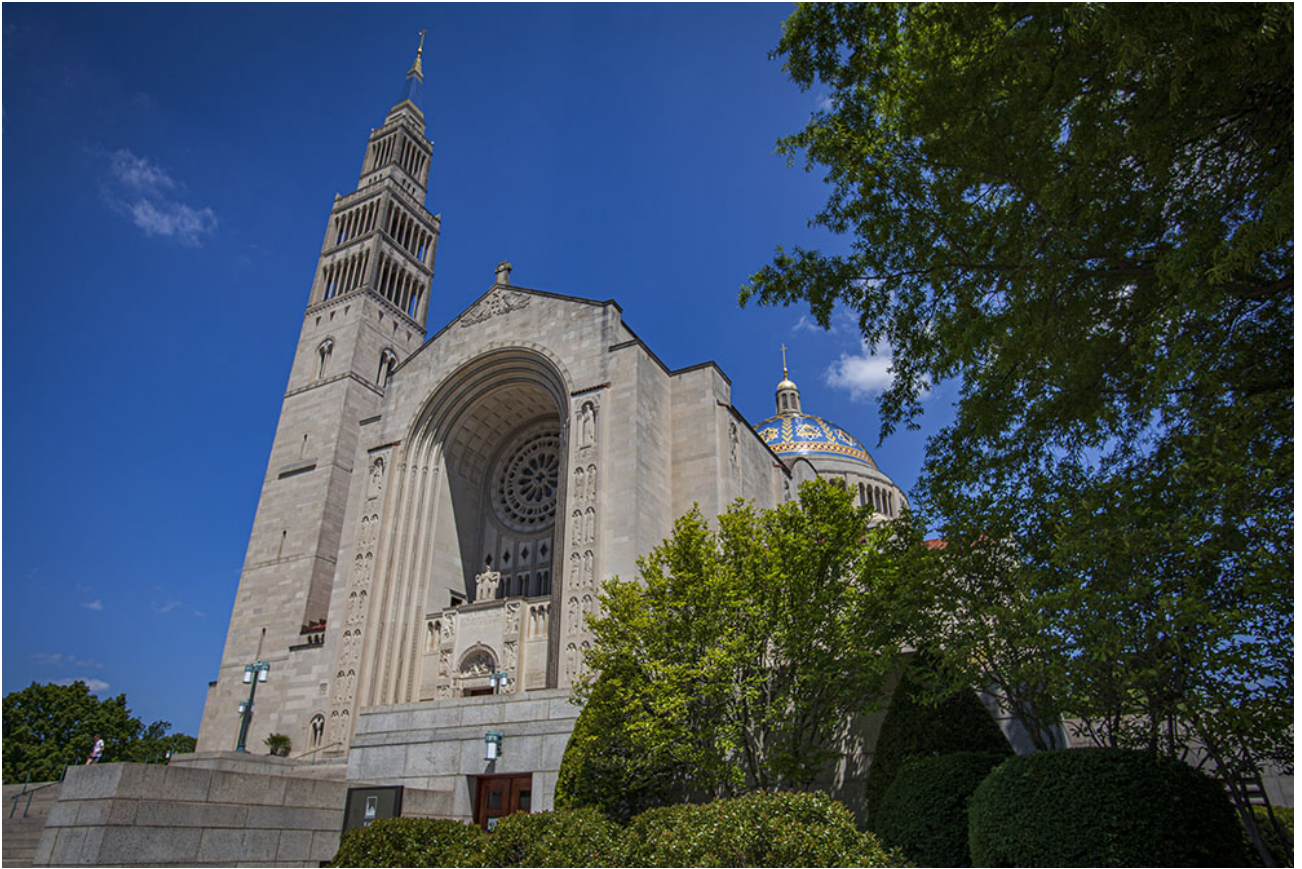
The Basilica of the National Shrine of the Immaculate Conception in Washington is seen in mid-May 2020.