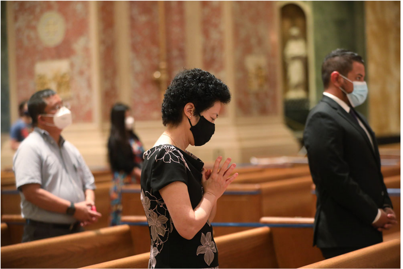
People pray during a 2020 Mass at the Cathedral of St. Matthew the Apostle in Washington.