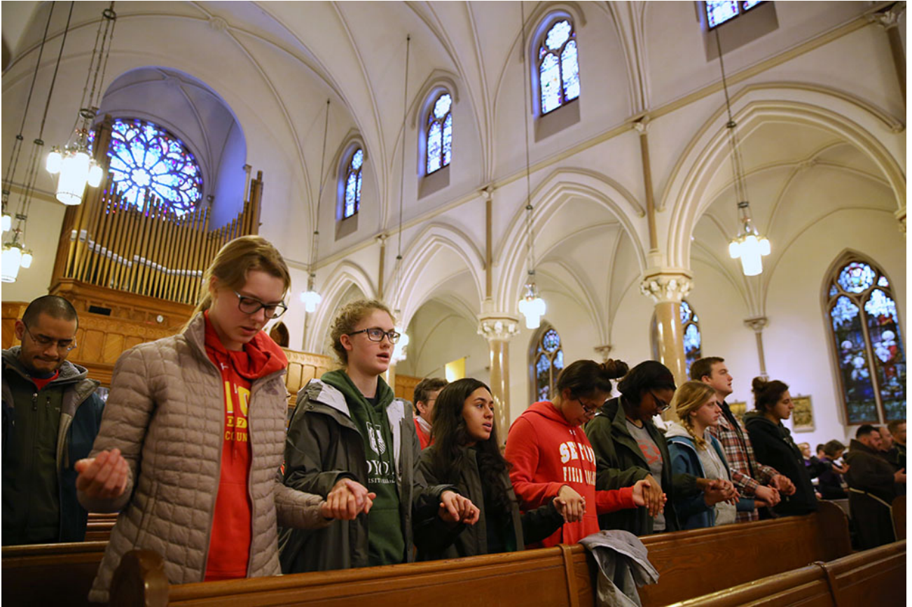
Students from Elizabeth Seton High School in Bladensburg, Maryland, pray during a March 24, 2018 Mass at St. Patrick Catholic Church in Washington.