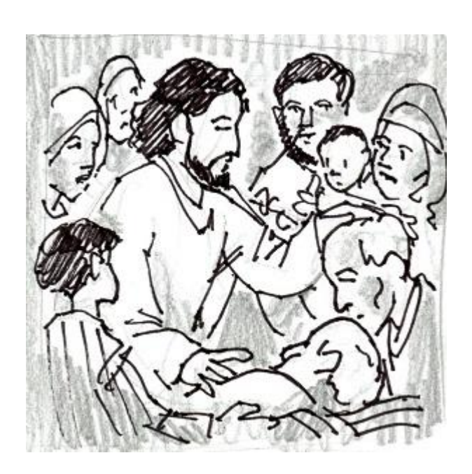
"Everyone is looking for you" (Mark 1:37).