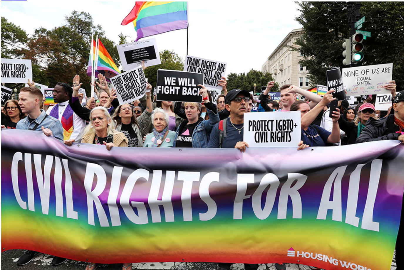
Activists demonstrate in support of LGBTQ rights outside the U.S. Supreme Court in Washington Oct. 8, 2019.