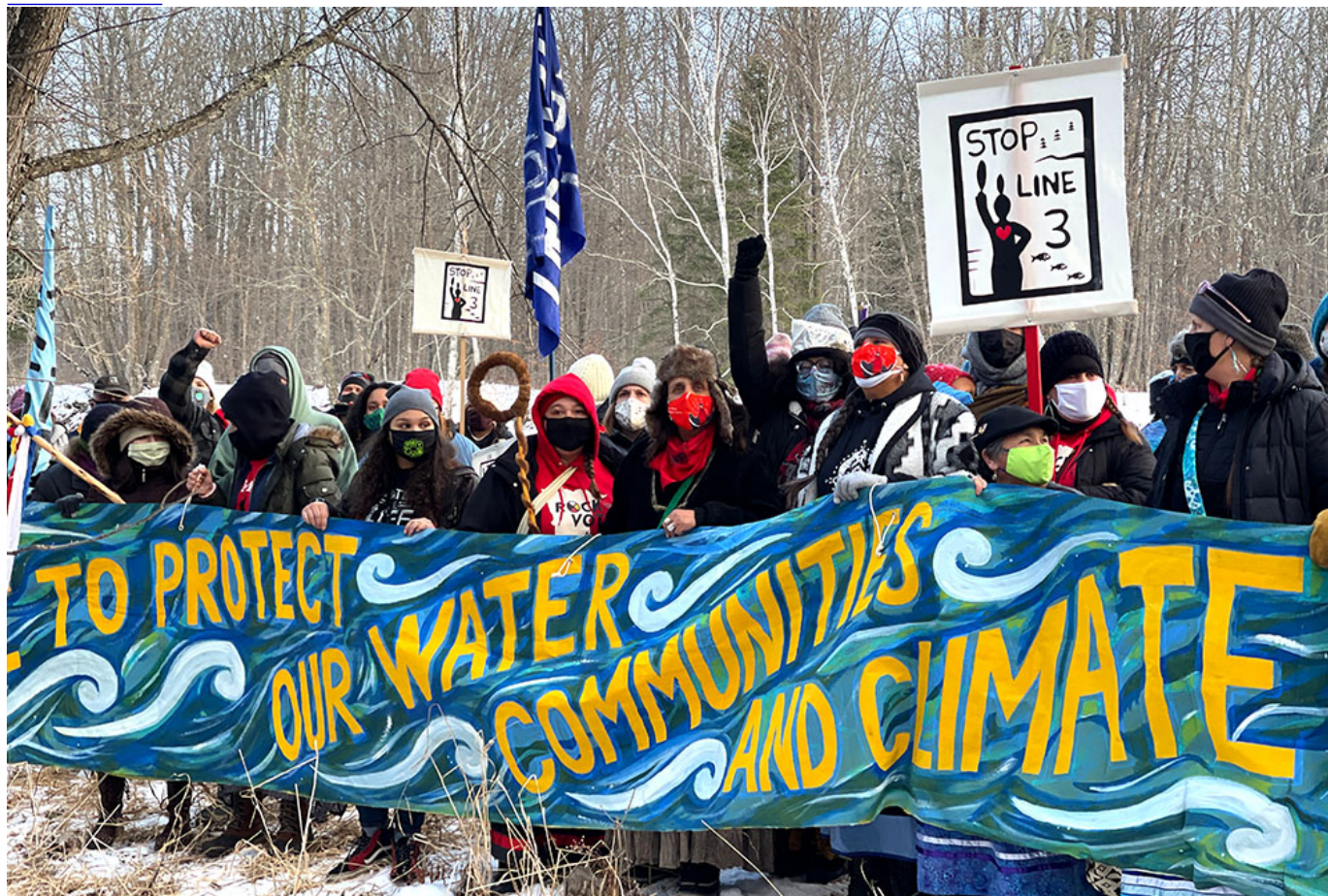
Protesters demonstrate against the Enbridge Line 3 Pipeline in northwestern Minnesota on Dec. 17, 2020.