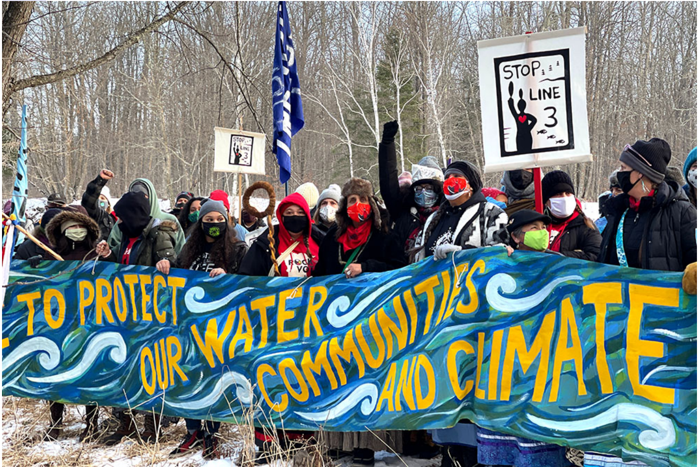
Protesters demonstrate against the Enbridge Line 3 Pipeline in northwestern Minnesota on Dec. 17, 2020.