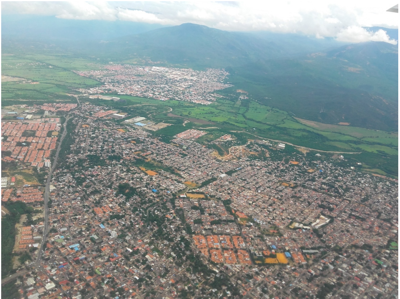
The Colombia-Venezuela border at Cúcuta

Unemployment in Cúcuta reached 25% at the end of 2020, and informal, unstable work arrangements are dominant in the city's labor market. The pandemic has further intensified the social crisis.