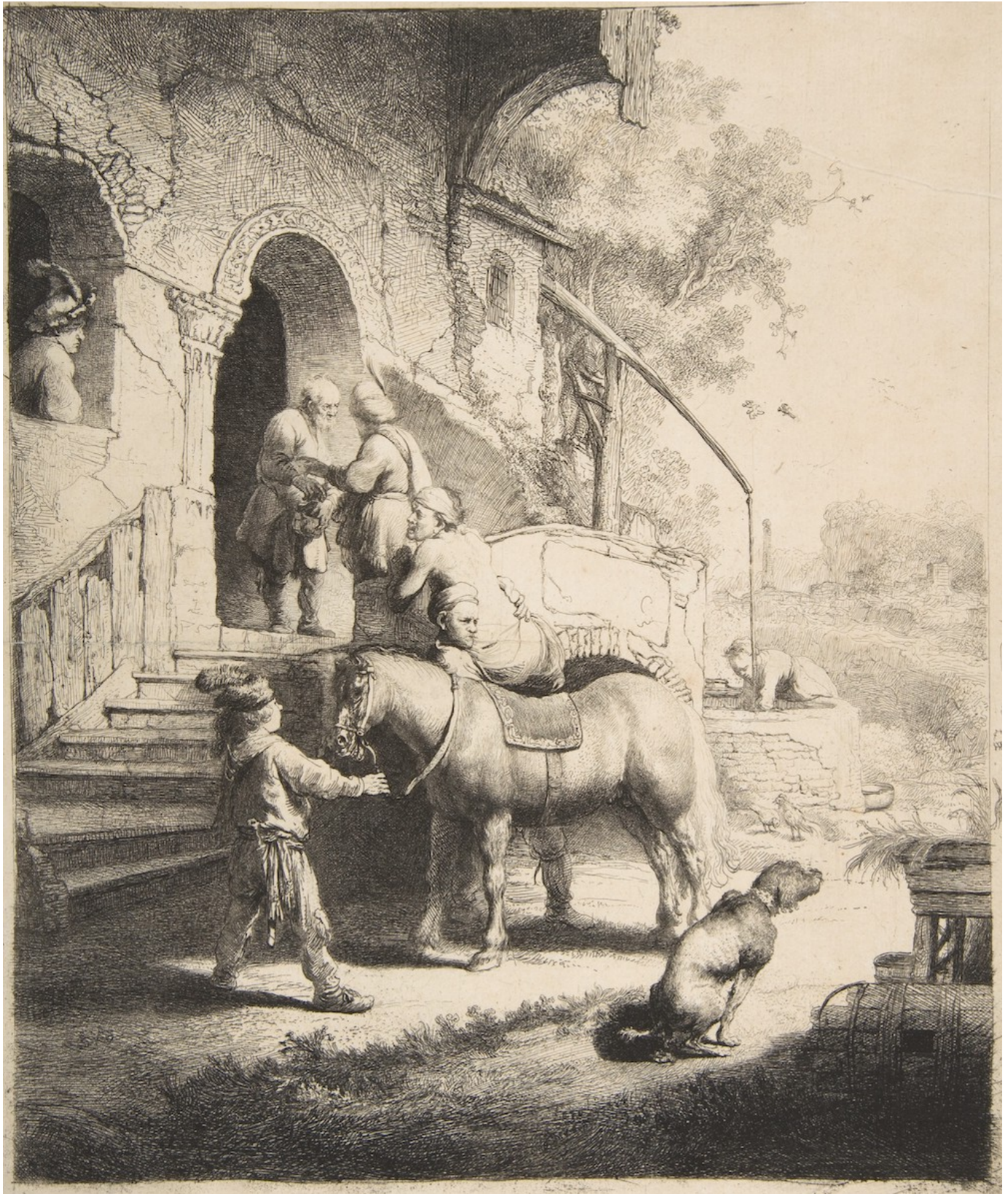
"The Good Samaritan," etching by Rembrandt van Rijn, 1633 (Metropolitan Museum of Art)