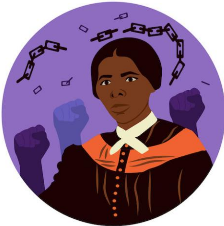
Harriet Tubman, abolitionist