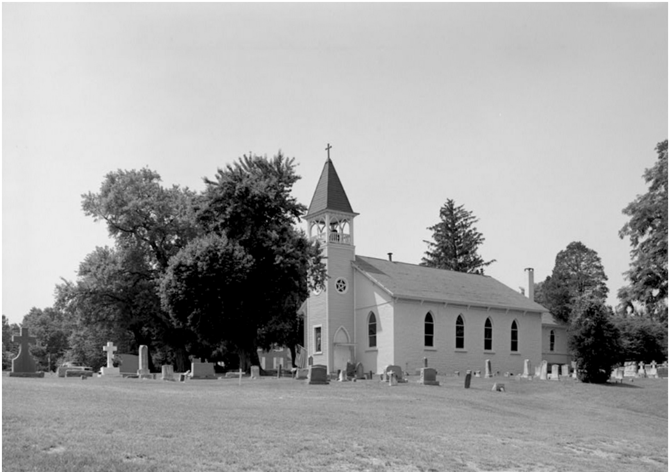
Sacred Heart Church at Whitemarsh in Bowie, Maryland, built around 1741

From 1833 until the meeting of the First Plenary Council of Baltimore in 1852, the metropolitan and each of his suffragans drew up a list of three names, a terna, for each vacant see, and the ternas were sent to both the metropolitan and the Propaganda Fide office in Rome, as the United States was still considered mission territory. The bishops included their reasons for the names given, but the ternas were only recommendations, and the final terna to be brought to the pope was drawn up by the cardinal members of Propaganda Fide.