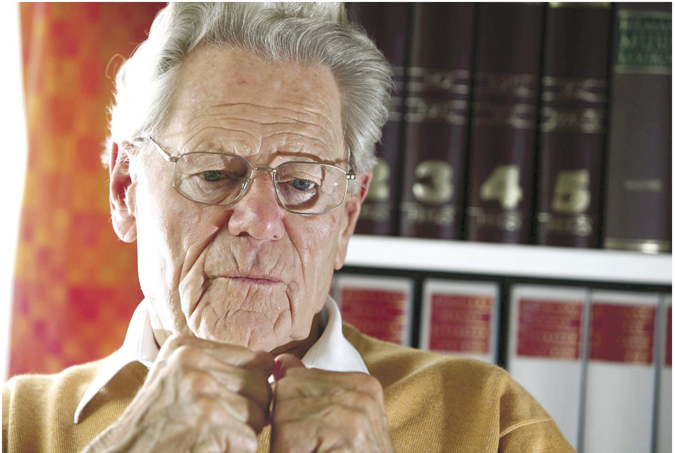
Fr. Hans Küng at home in Tübingen, Germany, in 2010

To the surprise of many, Küng requested a meeting with Ratzinger shortly after Ratzinger was elected pope in April 2005. The two priests had retained their respect for one another and a limited correspondence over 45 years. Ratzinger, now Pope Benedict XVI, quickly agreed to meet Küng. The pair talked for four hours and dined at Benedict's summer residence at Castel Gandolfo.