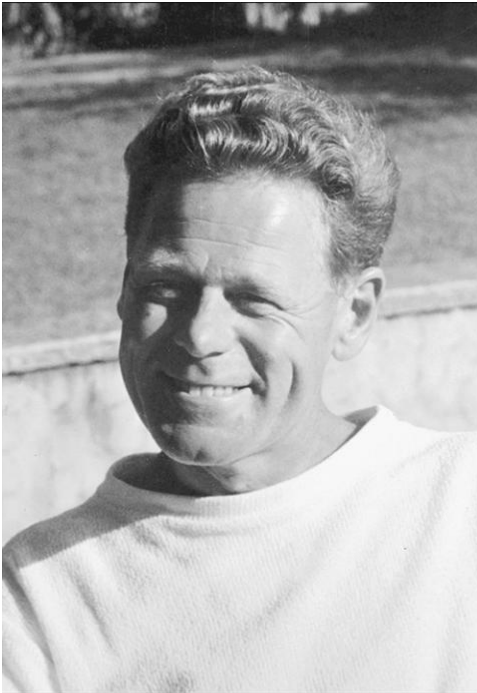
A younger Fr. Hans KÃ¼ng is seen in an undated photo.

Not only did progressive bishops seek out KÃ¼ng's acumen and writing skills, but his fluency in French, Italian, Dutch, German, English and Latin made him the go-to guy in dealing with the press. He was quick to publish his views on council texts and backroom maneuvering in leading papers and was a frequent television guest, remembered as much for his good looks and business suits as for his expertise.