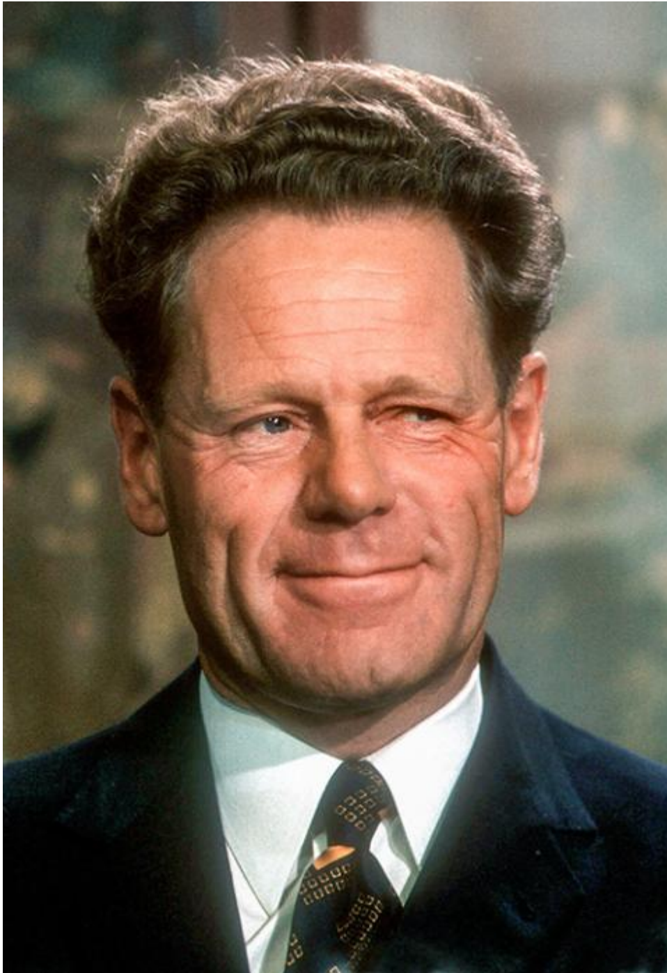
Fr. Hans K ng in 1974

In his most popular book â?? Christ sein (On Being a Christian) â?? which quickly sold more than 200,000 hard covers in German alone when it was released in 1974, K ng said he probed theological issues that are of concern to any educated person. He wrote for those "who believe, but feel insecure," those who used to believe "but are not satisfied with their unbelief" and those outside the church who