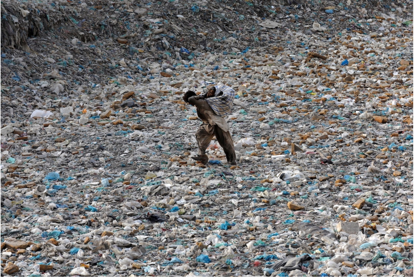
A boy carrying a sack of recyclables walks through trash in Karachi, Pakistan, June 4, 2020.