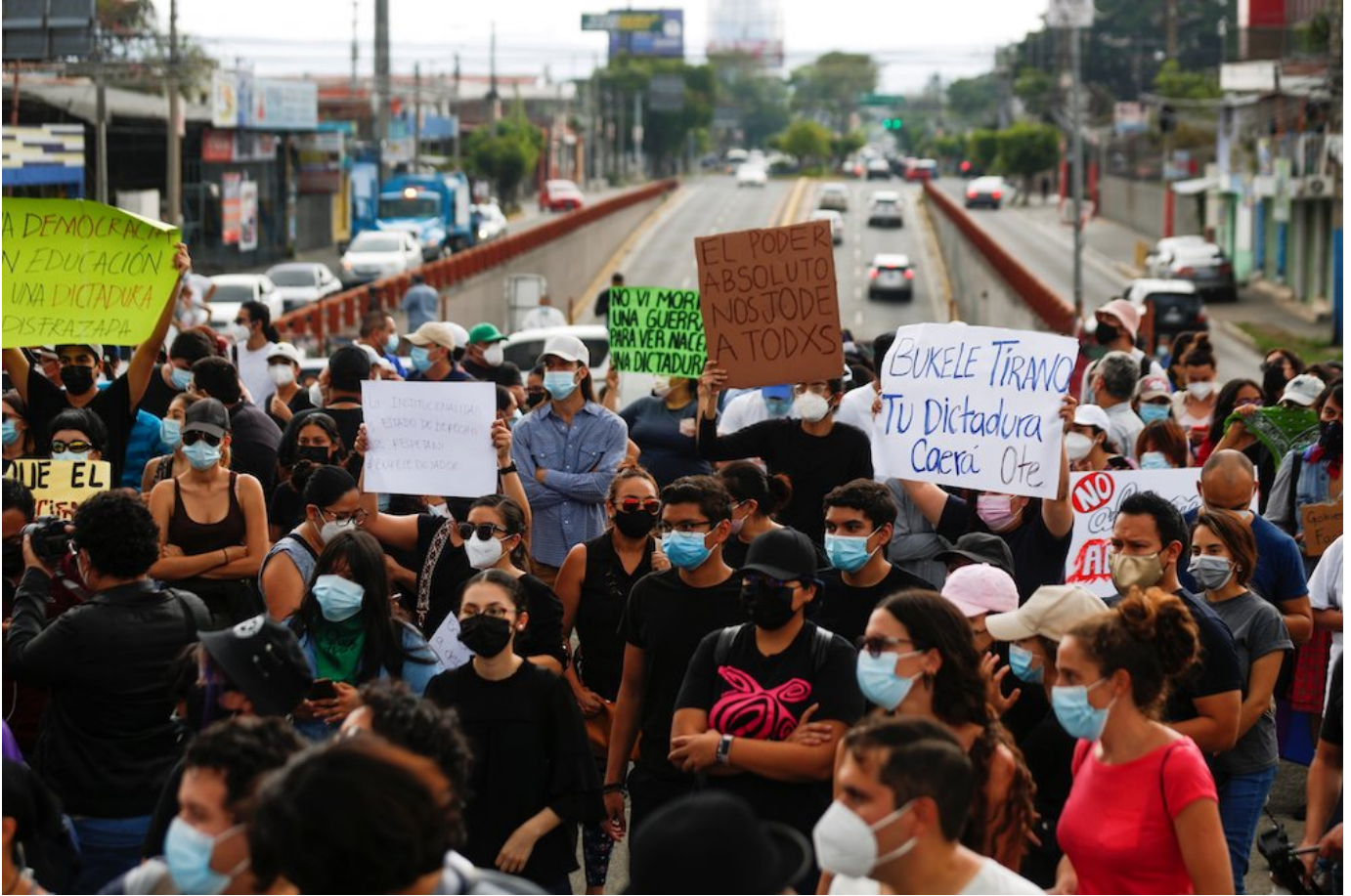
People protest in San Salvador, El Salvador, May 2, 2021, after the Salvadoran congress removed constitutional court judges and the attorney general.