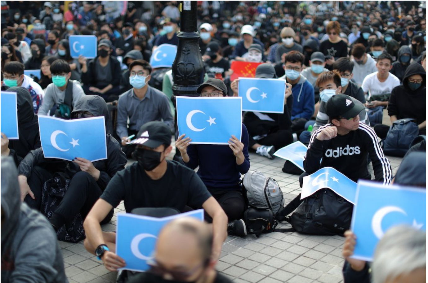
Hong Kong protesters hold East Turkestan Uighur flags at a rally in support of Xinjiang Uighurs' human rights, in Hong Kong Dec. 22, 2019.