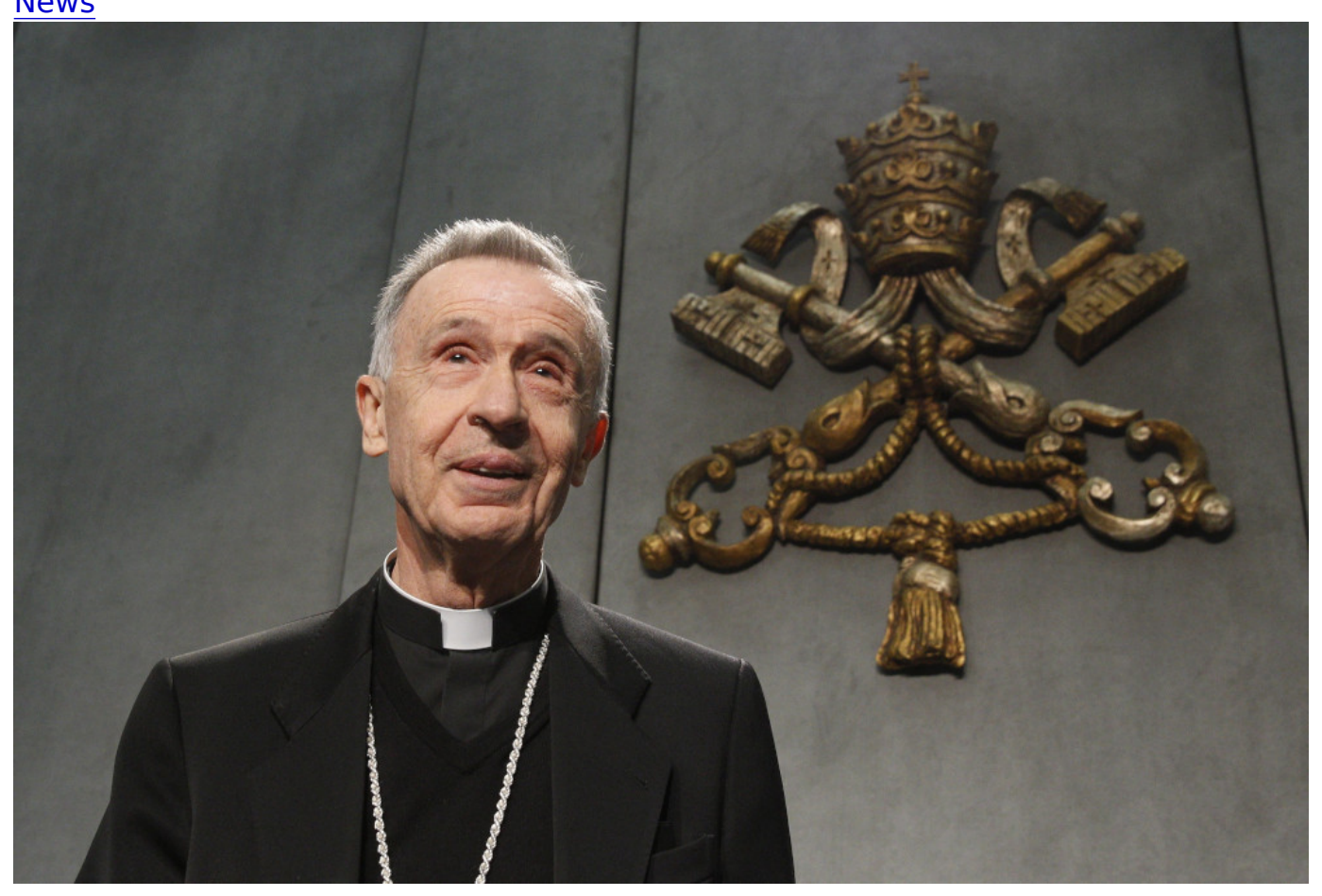
Then-Archbishop Luis Ladaria Ferrer speaks at a Vatican press conference in this Sept. 8, 2015, file photo.