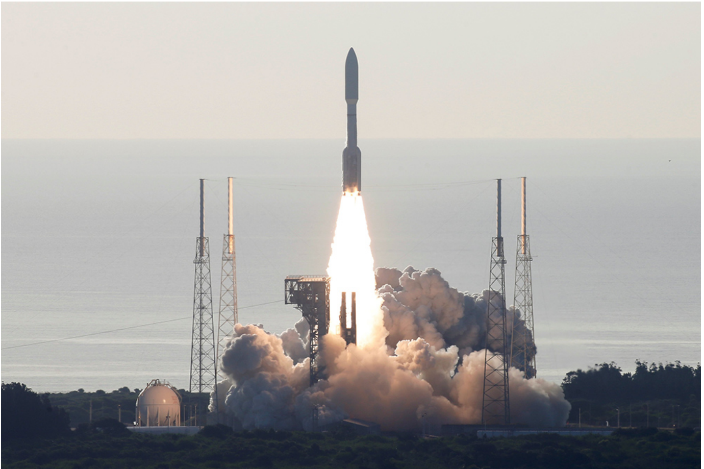
A United Launch Alliance Atlas V rocket carrying NASA's Mars "Perseverance" rover vehicle takes off from Cape Canaveral Space Force Station in Cape Canaveral, Florida, in this July 30, 2020, file photo.

My youthful diet of science fiction eventually posed other questions. Is there intelligent life on other planets? If so, do they have souls? Did Christ's dying and rising save them too? Might they have a religion? Do they have sacred texts that tell fanciful stories about their origins?