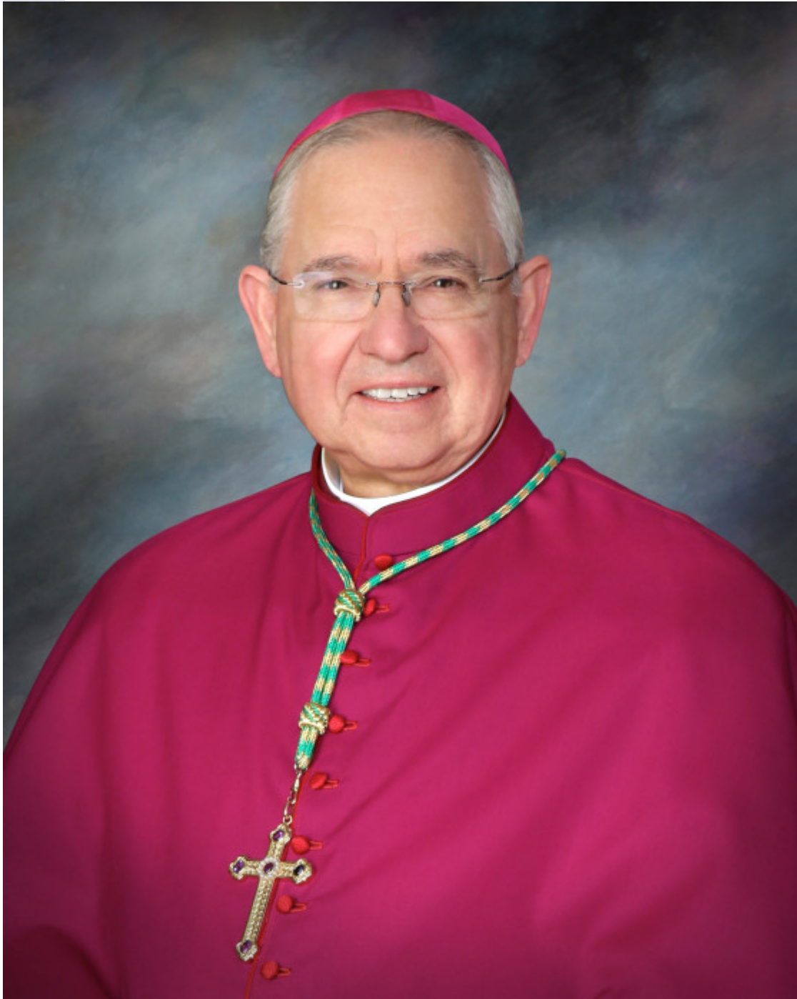
Archbishop José H. Gomez of Los Angeles, president of the U.S. Conference of Catholic Bishops, is seen in this Nov. 20, 2019, file photo.