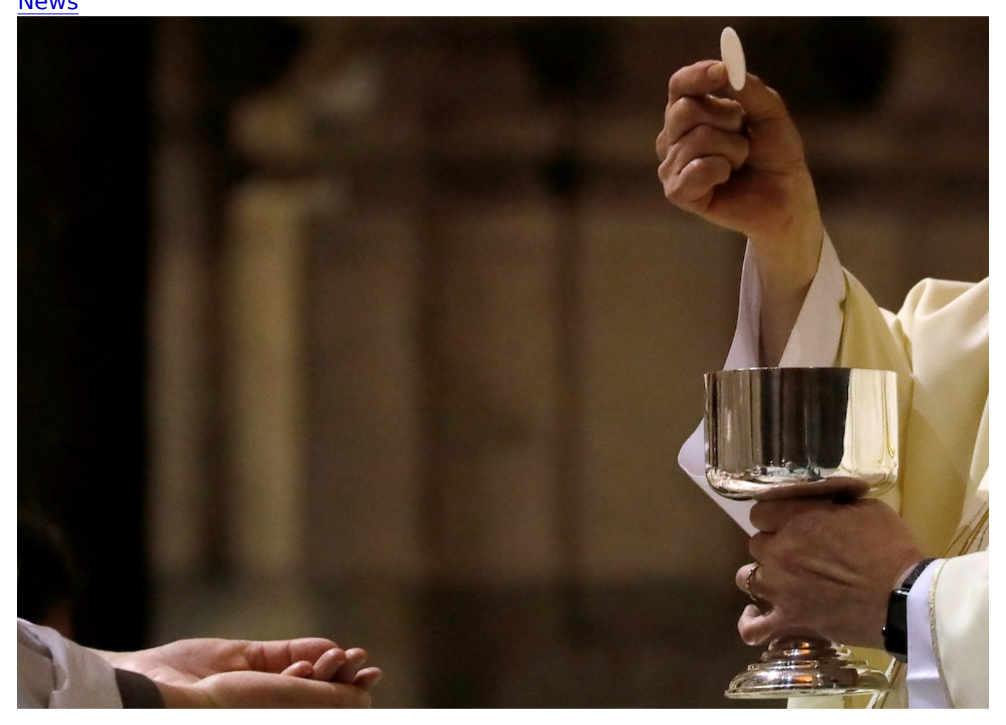
A priest distributes Communion during Mass.