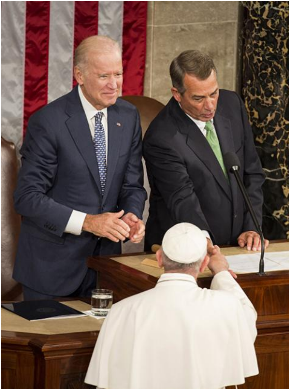
Pope Francis shakes hands with then-U.S. Speaker of the House John Boehner as then-U.S. Vice President Joe Biden looks on during a joint meeting of Congress on Capitol Hill Sept. 24, 2015, in Washington.

When Boehner told them he had invited the Polish pope to address Congress as a head of state, it seemed to put them at ease a bit. Pope John Paul II never accepted his invitations, but fast forward 20 years later, Boehner still gets weepy talking about that September day when Pope Francis arrived at the Capitol.