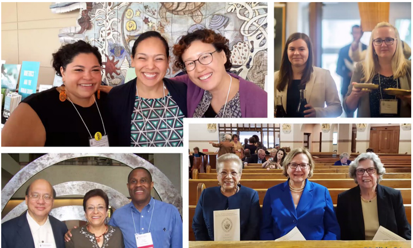
Photos from more recent past conventions of the Catholic Theological Society of America