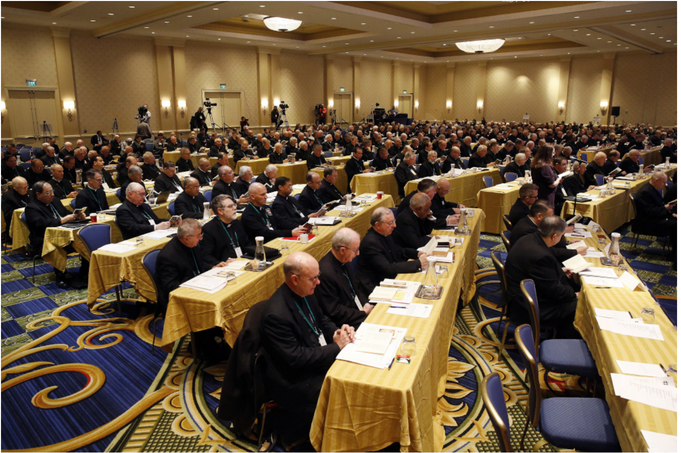
Members of the United States Conference of Catholic Bishops gather for the annual fall meeting, on Nov. 12, 2018, in Baltimore.