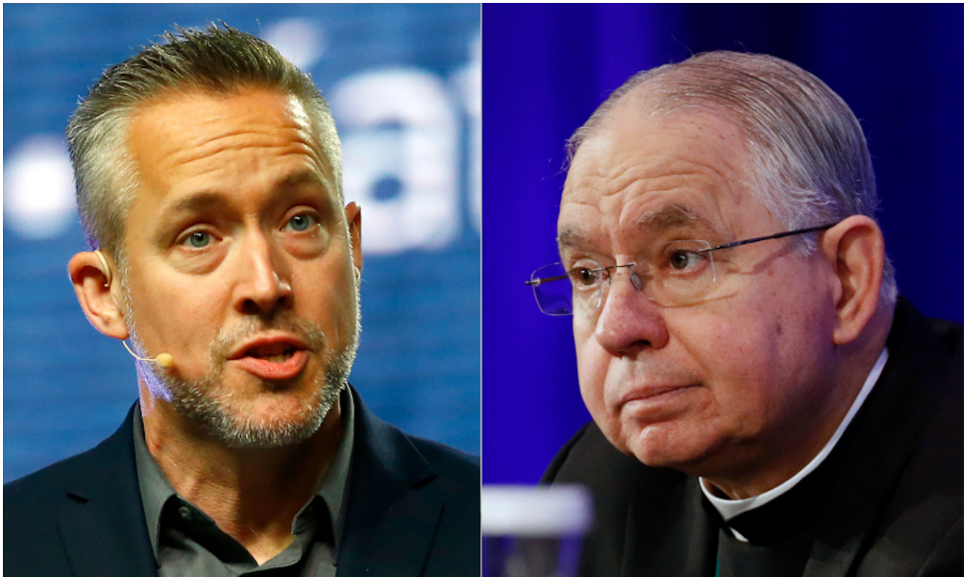
Southern Baptist Convention President J.D. Greear, left, and U.S. bishops' conference president Archbishop Jose Gomez.

(Interestingly, although the Catholic Church forbids women from becoming priests, it does allow them to preach, as long as their talk is not a homily. These are the kind of canonical distinctions Catholics thrive on. A homily is defined as a sermon given by a priest at Mass after the reading of the Gospel. Laymen and women cannot give homilies. However, they can give "reflections" on the readings, a legal loophole big enough for a smart pastor to drive a truck through.)