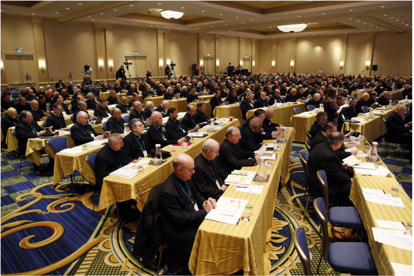
Members of the United States Conference of Catholic Bishops gather for the annual fall meeting, on Nov. 12, 2018, in Baltimore.