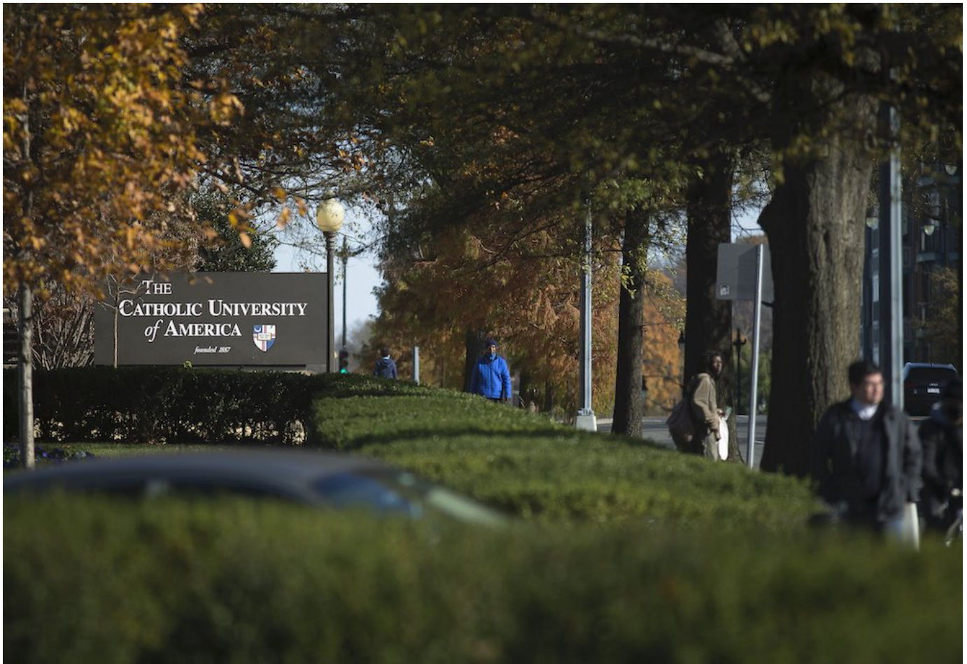
People in Washington walk near the campus of The Catholic University of America Nov. 24, 2020.