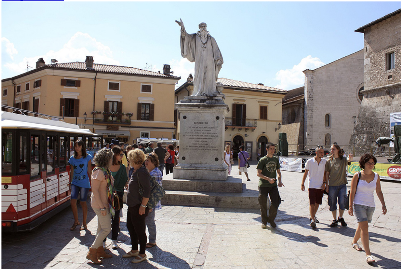
Tourists and townspeople surround a statue of St. Benedict Aug. 14, 2013, in the small Italian town of Norcia.

Opinion Spirituality Columns Religious Life