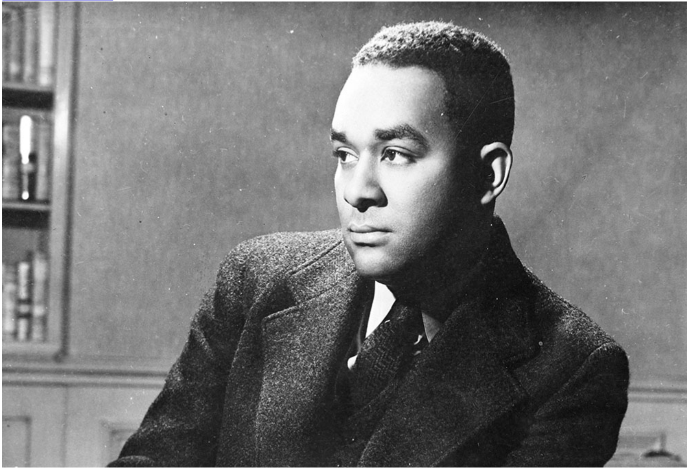
Novelist Richard Wright, circa 1935-42