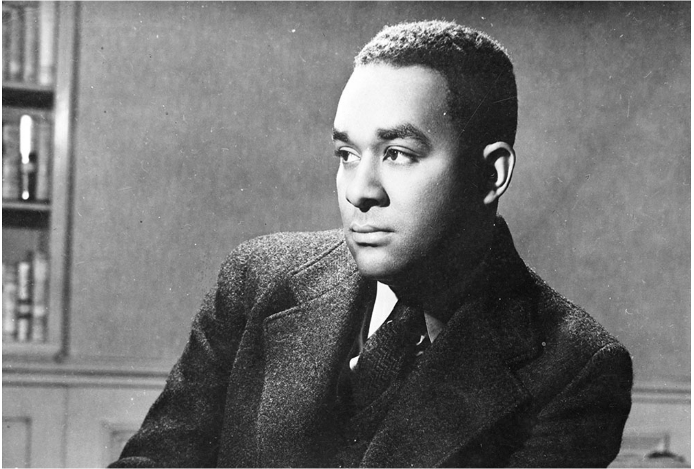
Novelist Richard Wright, circa 1935-42