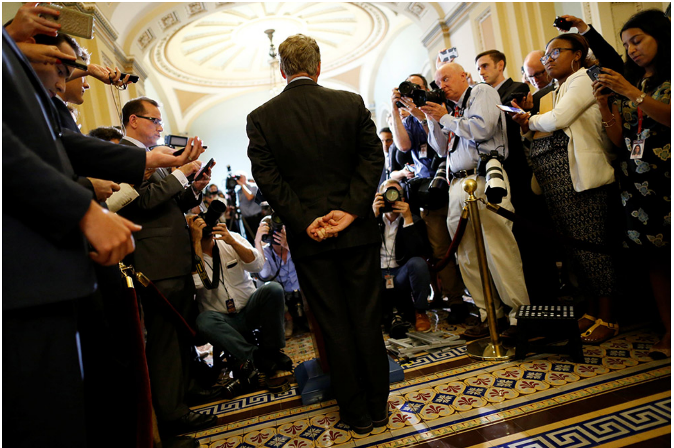
Journalists interview a U.S. senator in this illustration photo.

"They may feel, and it may even be true, that their coverage is absolutely fair," he warned. "But it's also essential to avoid the appearance of a conflict of interest."