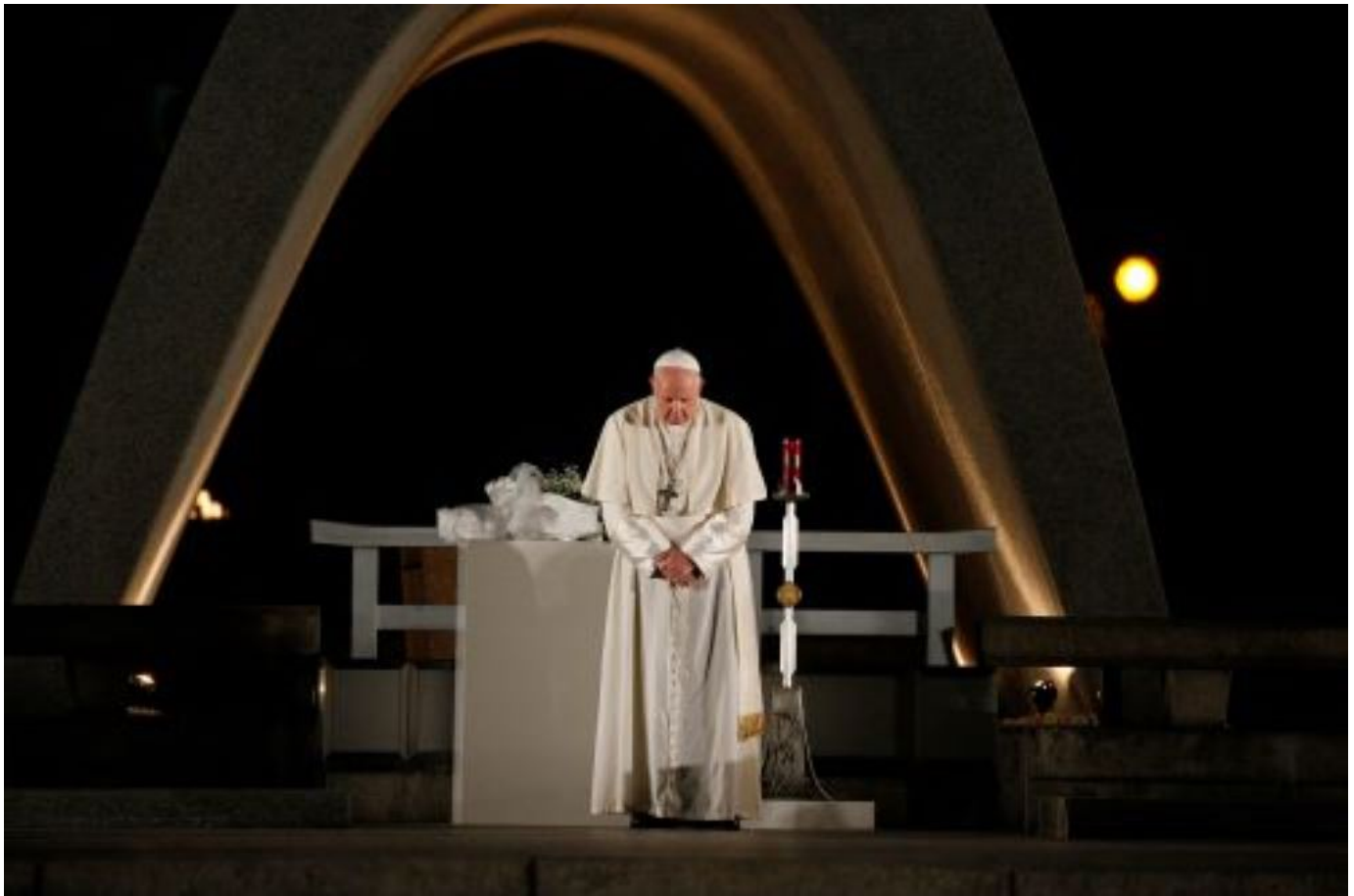
Pope Francis participates in a moment of silence at the Hiroshima Peace Memorial in Japan in 2019. "The use of atomic energy for purposes of war is immoral, just as the possessing of nuclear weapons is immoral," the pope said during that visit.

Today, I want you to feel in this hall the presence of all those who perished in Hiroshima and Nagasaki. I want you to feel, above and around us, a great cloud of a quarter-million. ...souls. Each person had a name. Each person was loved by someone. Let us ensure that their deaths were not in vain. ... The development of nuclear weapons signifies not a country's elevation to greatness, but its descent to the darkest depths of depravity. These weapons are not a necessary evil; they are the ultimate evil.