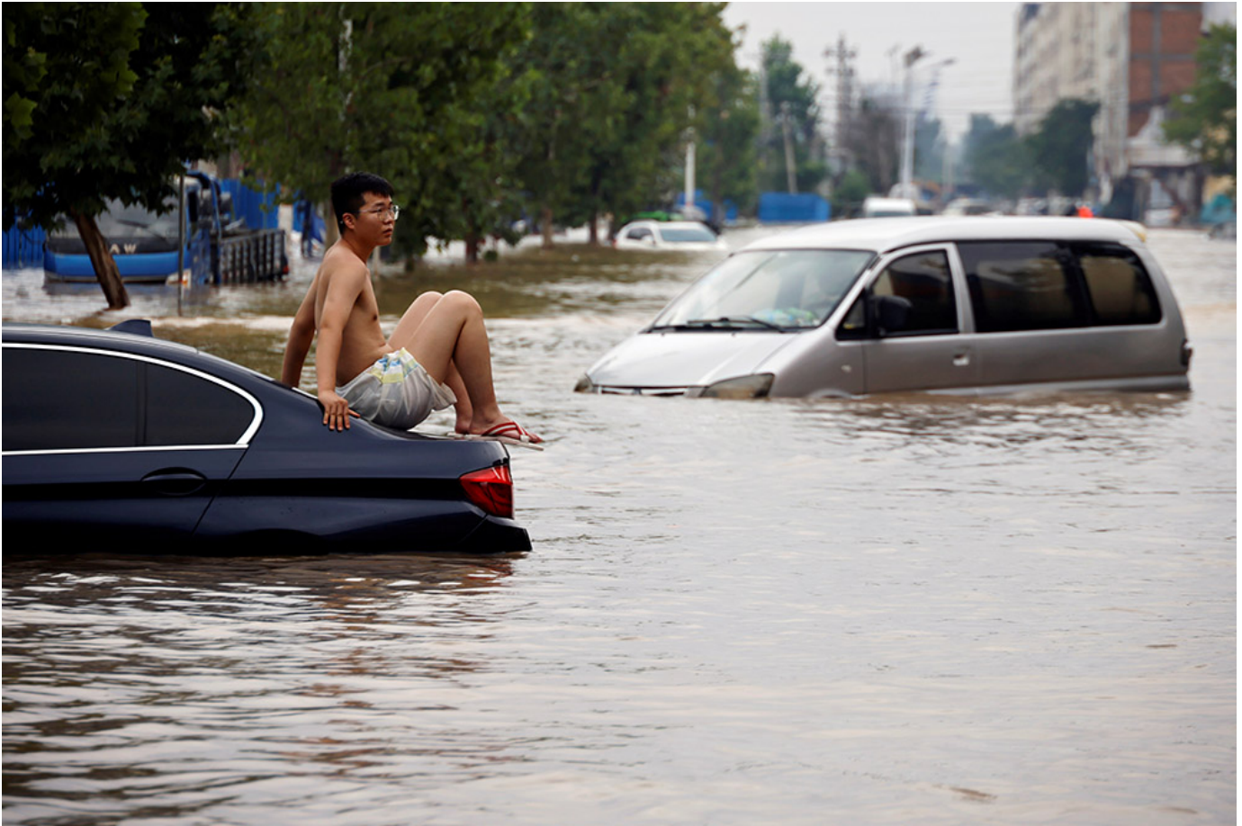
A man sits on a stranded vehicle on a flooded road following heavy rainfall in Zhengzhou, China, July 22.