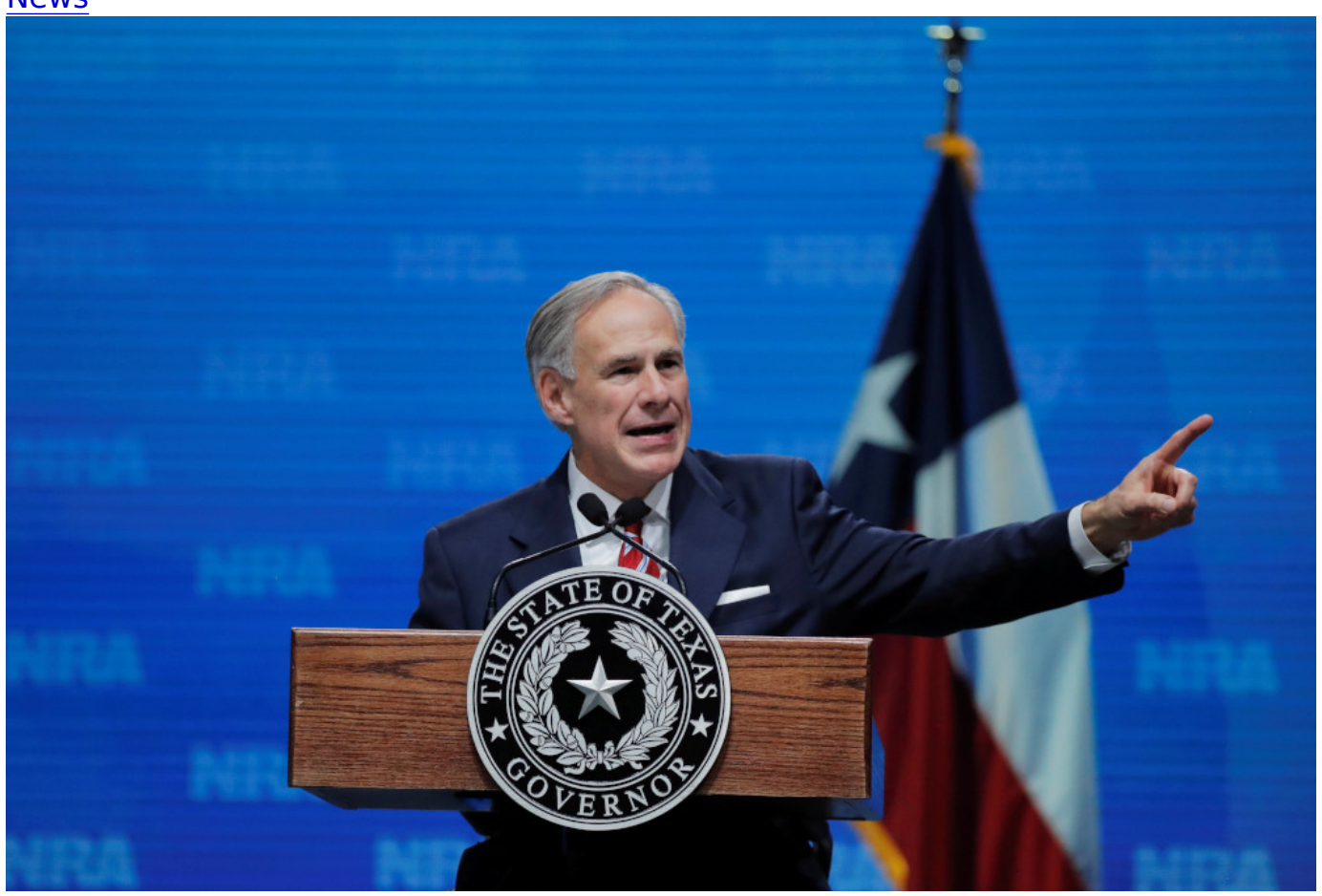
Texas Gov. Greg Abbott is seen in this 2018 file photo.