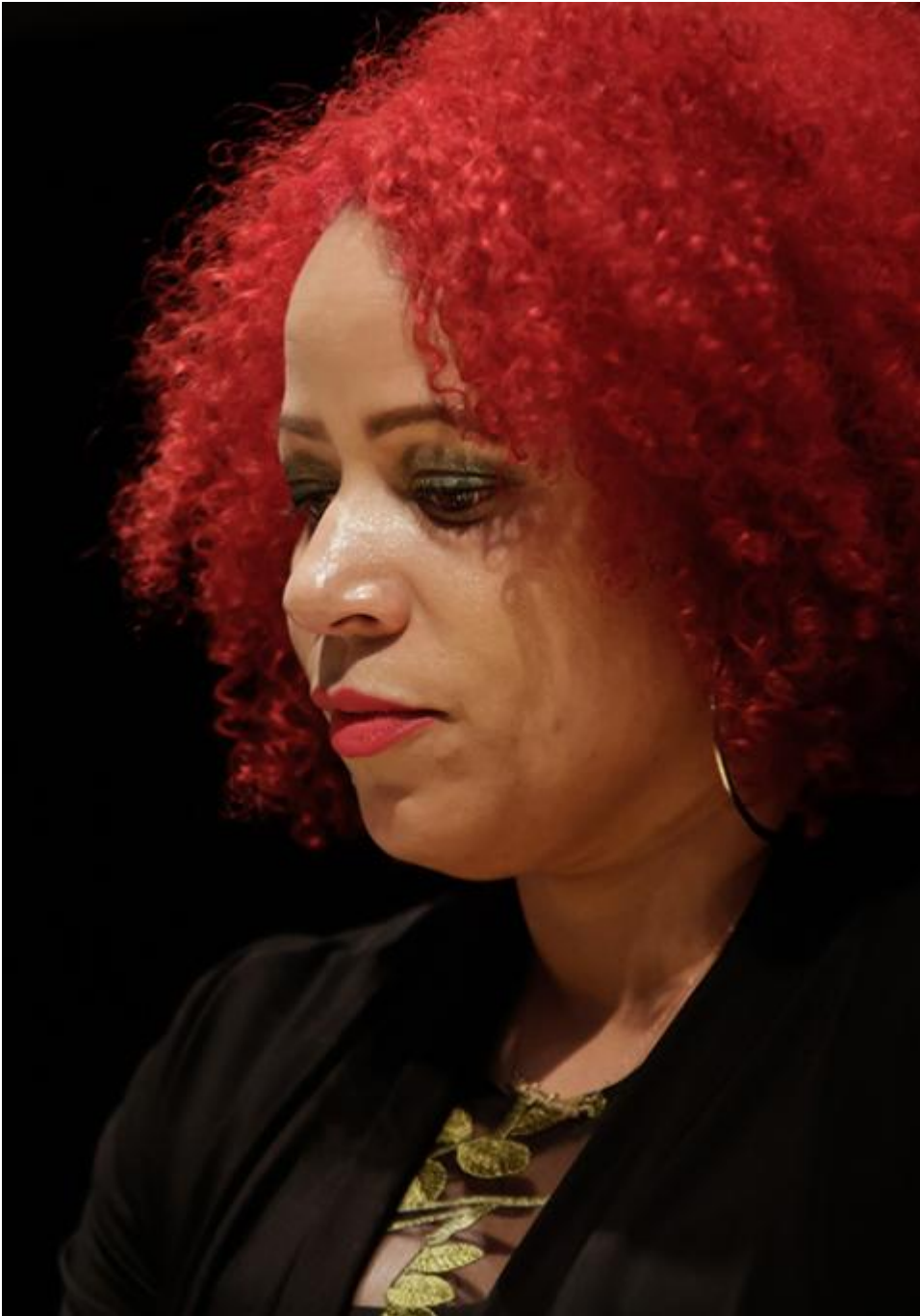
Nikole Hannah-Jones in 2018

The history of a person, and even more of a nation, is like a large river. There may be many tributaries. As the historiography of an era develops, new tributaries are discovered, especially in the case of populations that did not leave extensive written documentary evidence of their thoughts and deeds, such as slaves in the British North American colonies and young United States. If the goal of "The 1619 Project" was merely to point to the need for more attention on the many and varied