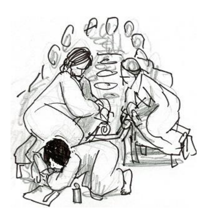
"I have something to say to you" (Luke 7:40).