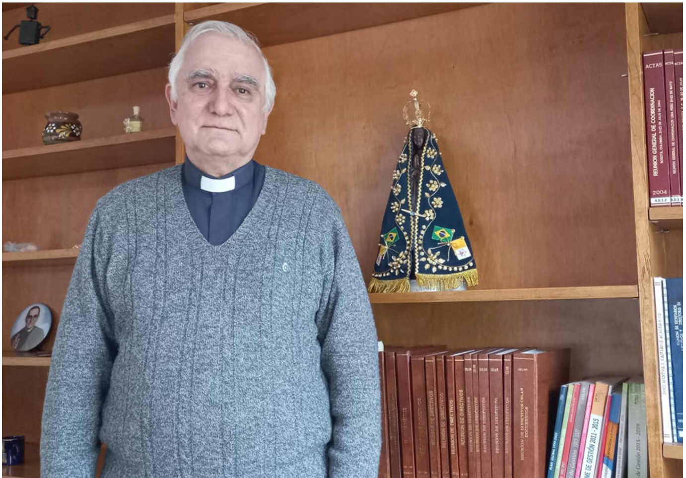
Archbishop Jorge Lozano of San Juan de Cuyo, Argentina, secretary general of the Latin American bishops' council

The process was modeled on the dozens of gatherings held around South America's Amazon region in preparation for the 2019 Synod of Bishops for the Pan-Amazon Region. The results of the consultation will be compiled by October into a working document for the assembly.