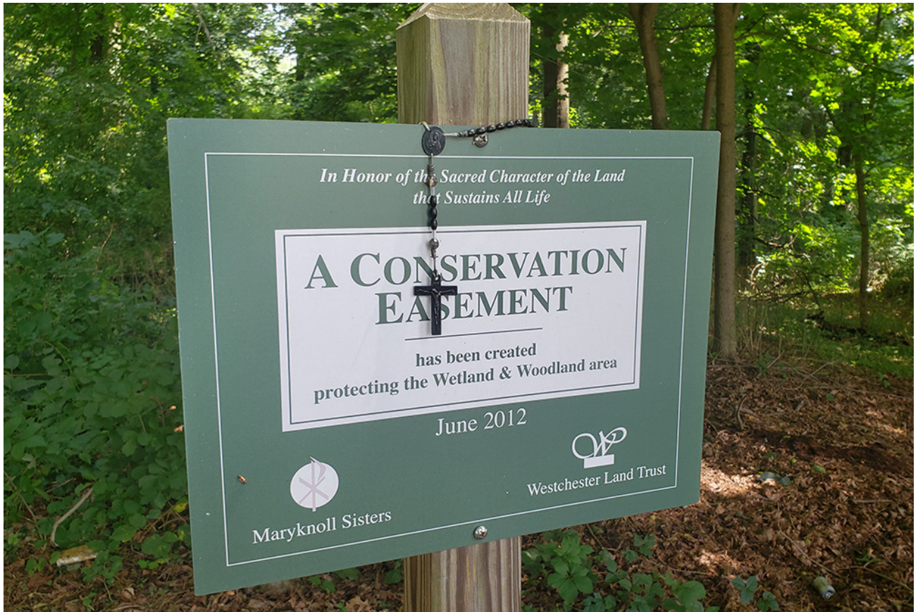
A rosary rests on a sign indicating the Maryknoll Sisters' conservation easement.

"And so we said, 'What does that mean?' It means we work towards just relationships not only with humankind, but with all nature, that we recognize our interconnectedness," she added. "The crisis is such that it is dangerous enough to destroy the whole Earth, and that's what we recognized."