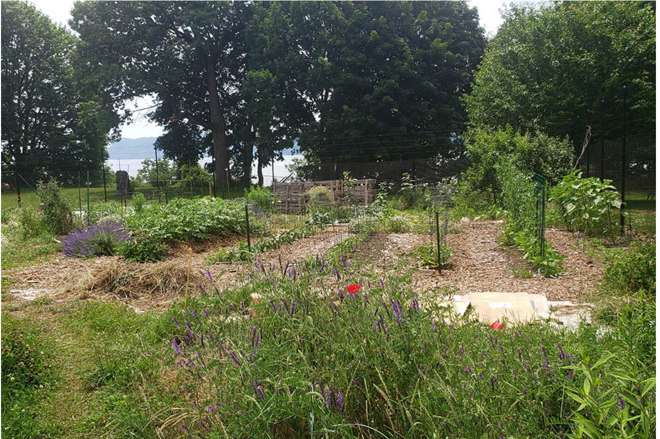
The land included in the Dominican Sisters' conservation easement includes a quarter-acre garden.