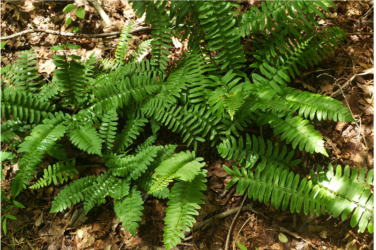
Ferns grow in the shade of woodlands in the Maryknoll Sisters' conservation easement in Ossining, New York.