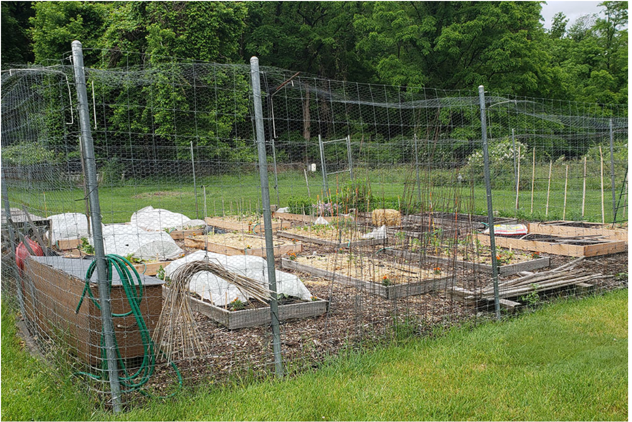
A garden in the area included in the land trust is surrounded by a fence meant to protect it from free-roaming deer.