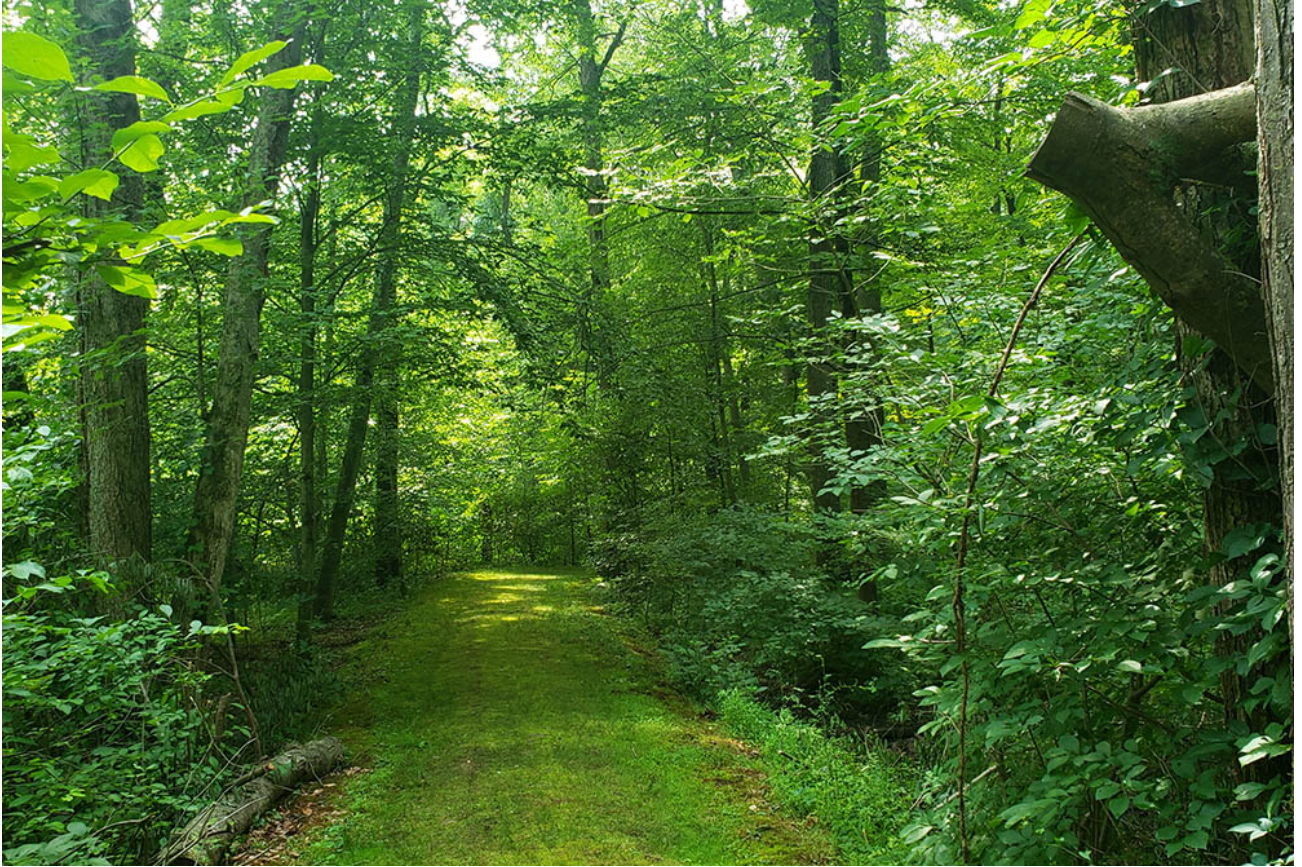
A trail winds through the area of the Maryknoll Sisters' property that is included in the conservation easement.