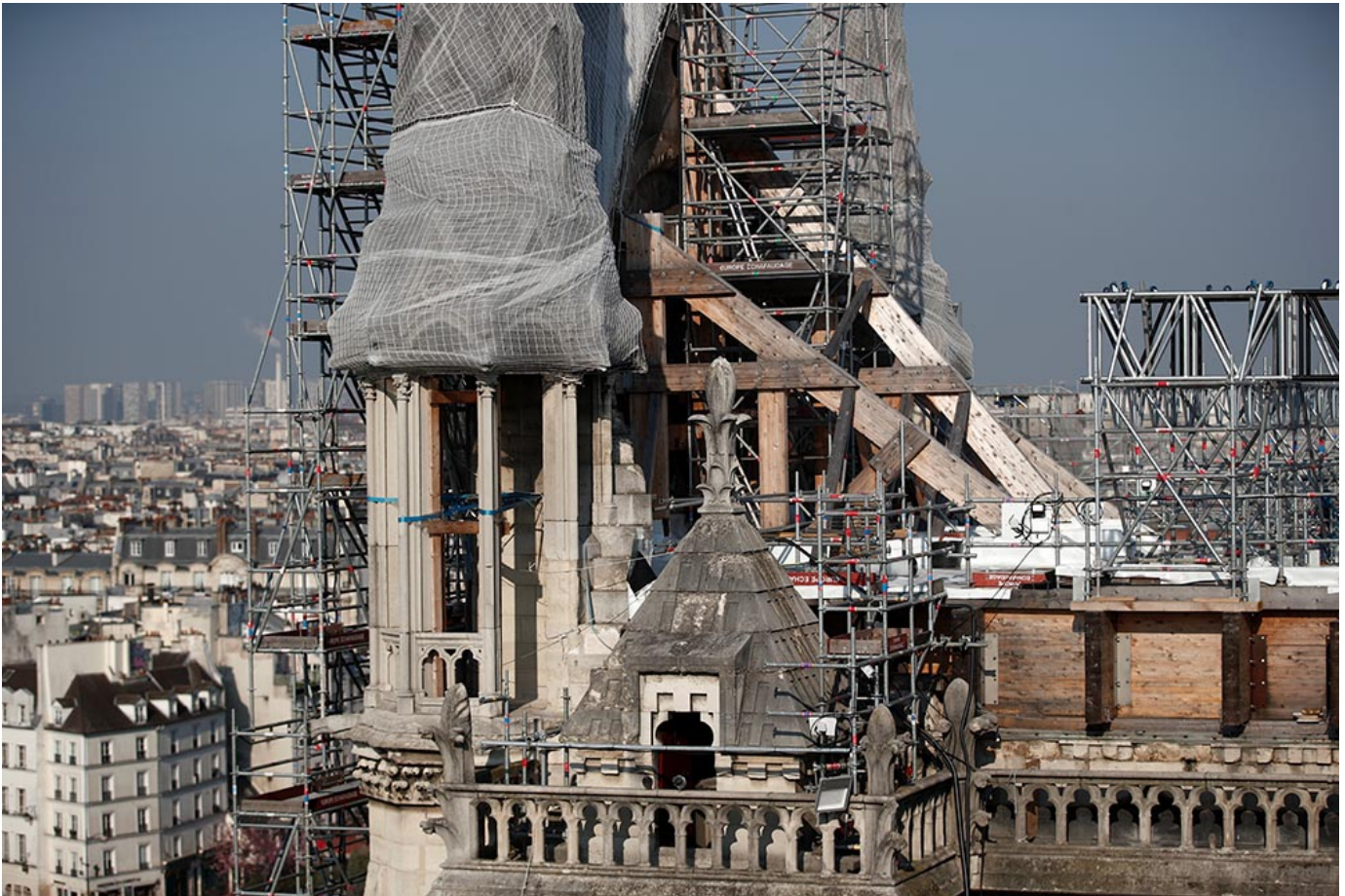
Scaffolding surrounds the damaged Notre Dame Cathedral April 15 in Paris.

As the burnt embers are cleared away and the great Notre Dame Cathedral is restored and rebuilt, let us find in that challenging but determined work the hope and the strength to open wide the doors of the church as a place for all of humanity to find refuge, to find healing, to find mercy in the one Body of Christ.