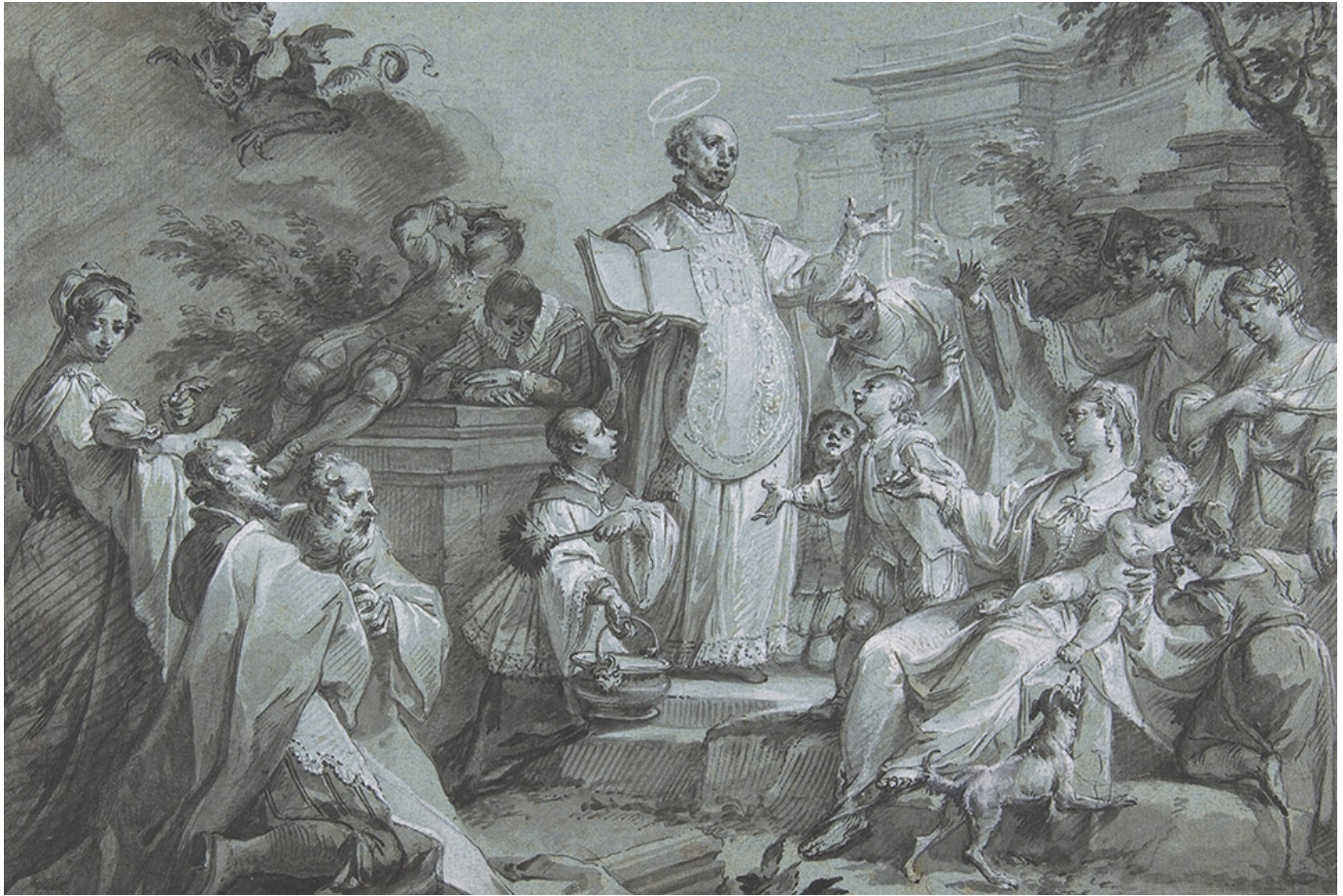
"Saint Ignatius of Loyola Preaching," by Johann Wolfgang Baumgartner, a drawing in ink dated before 1761 (Metropolitan Museum of Art)