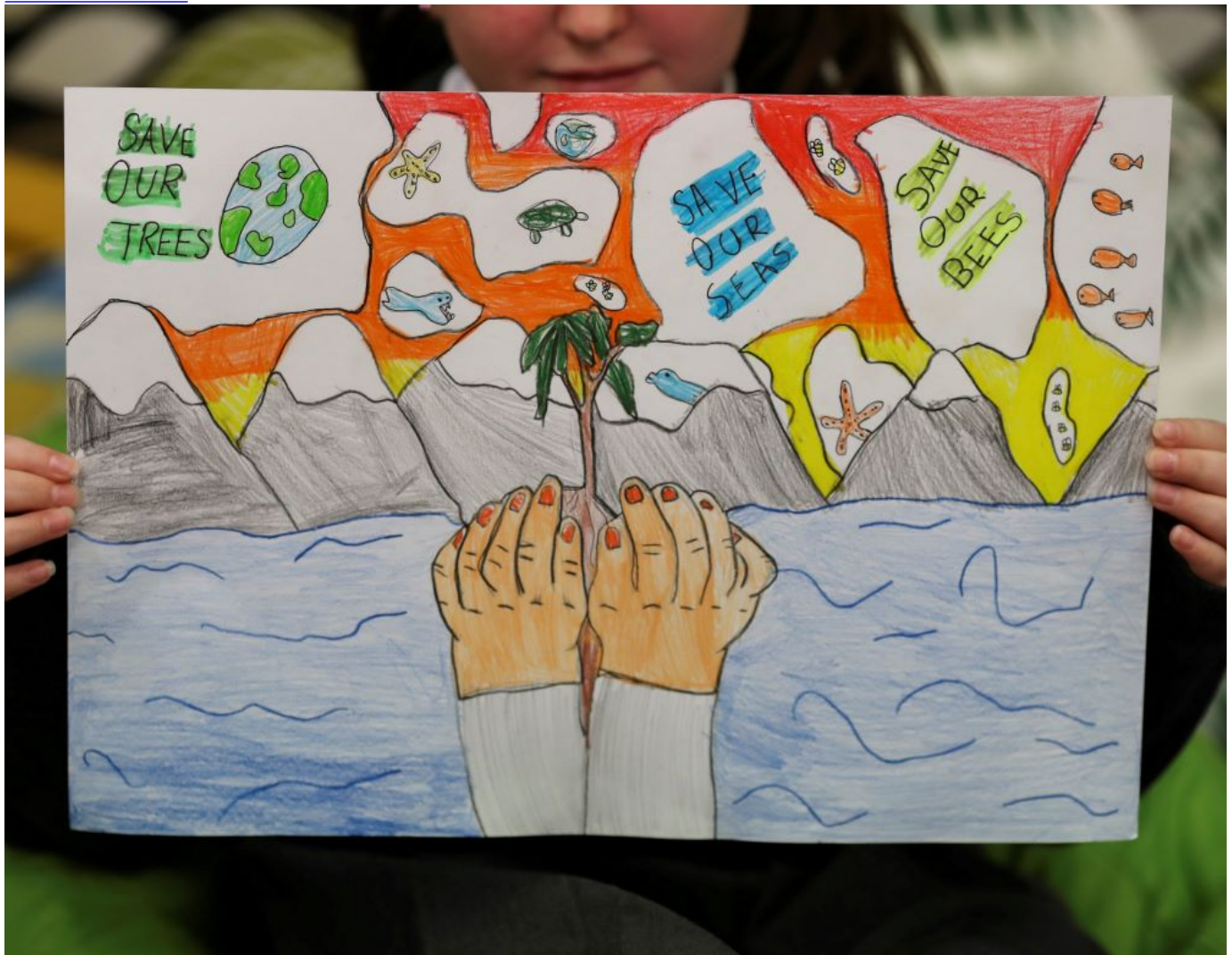
A student holds a poster at St. Conval's Primary School in Glasgow, Scotland, while learning about climate change ahead of COP26, the U.N. Climate Change Conference, which starts Oct. 31.