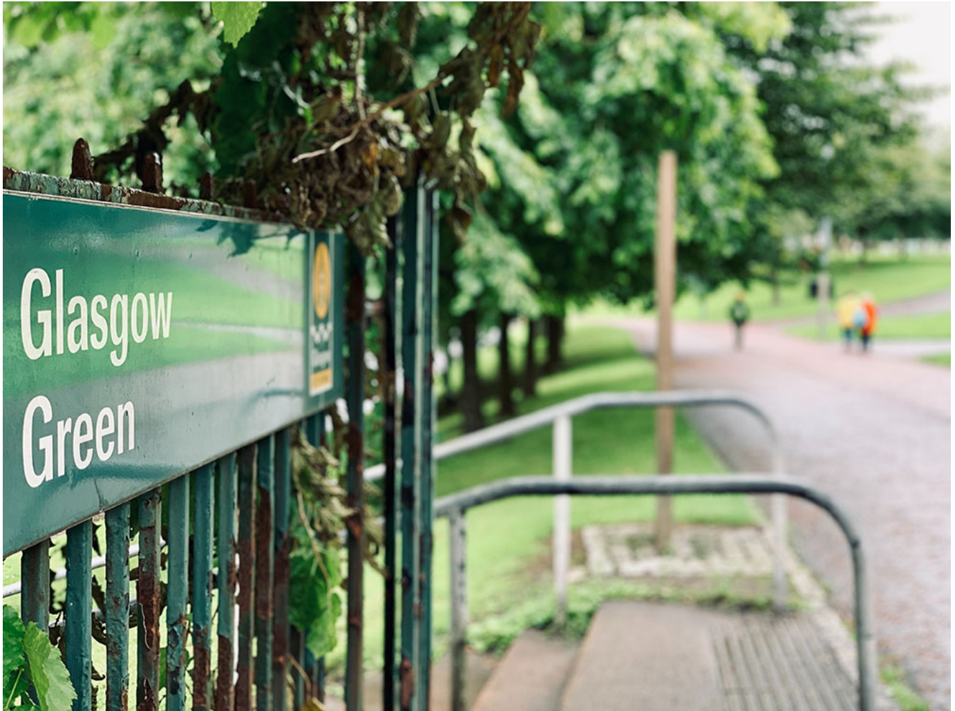
Glasgow Green at the Kings Bridge entrance to the park in Glasgow, Scotland. The city is hosting the United Nations climate conference known as COP26 on Oct. 31-Nov. 12.