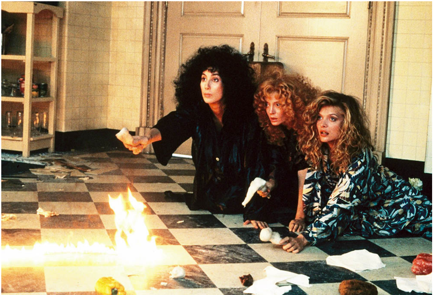
From left: Cher, Susan Sarandon and Michelle Pfeiffer in a scene from the 1987 movie "The Witches of Eastwick"