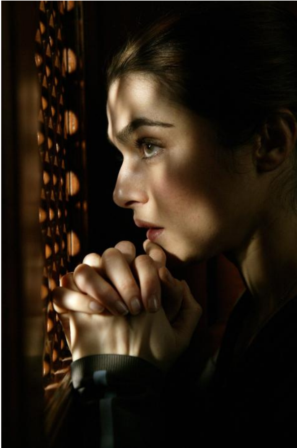
Rachel Weisz in a scene from the 2005 movie "Constantine"