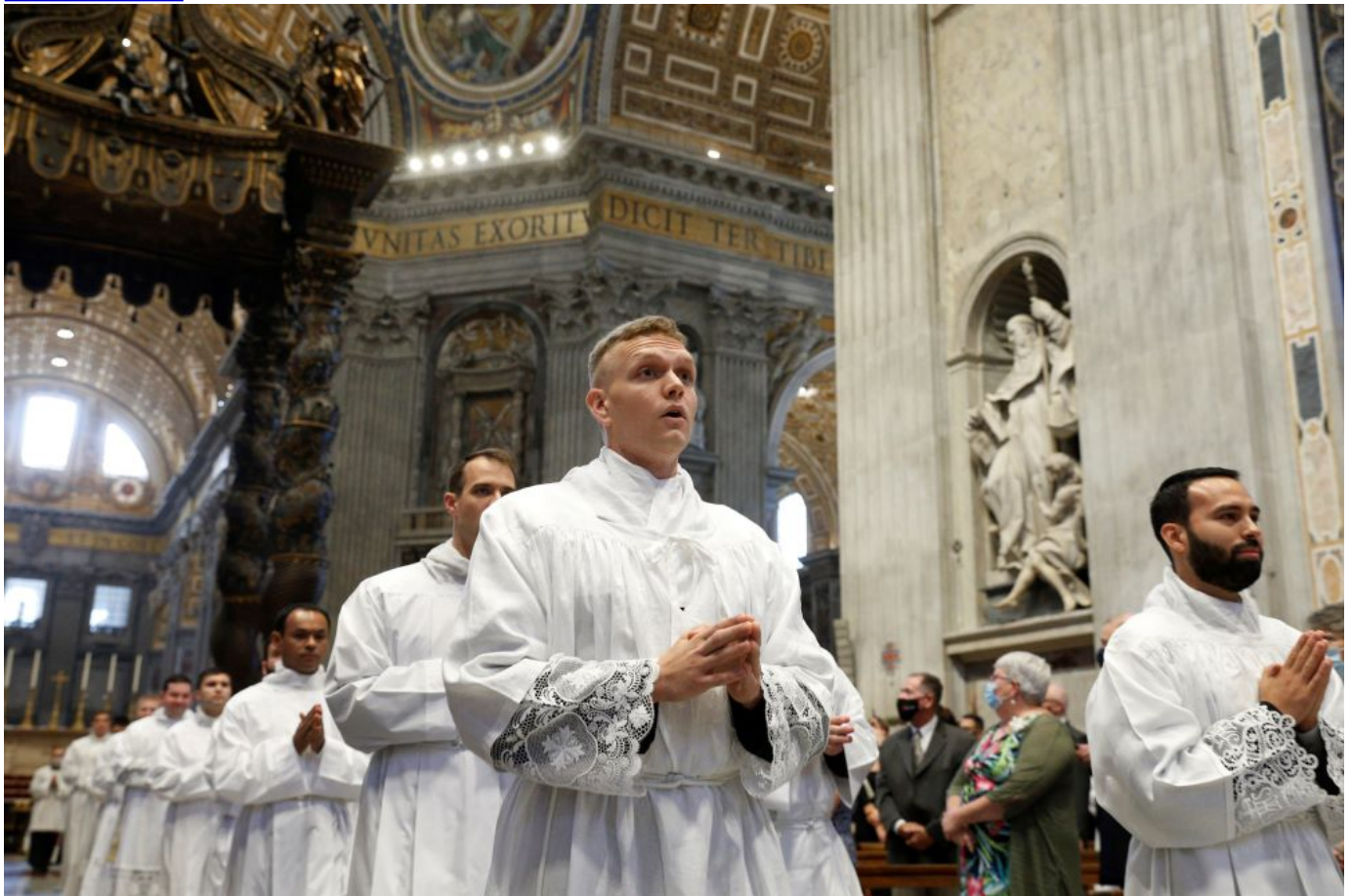
Seminarians from the Pontifical North American College walk in procession during the ordination of new deacons in St. Peter's Basilica at the Vatican in September.