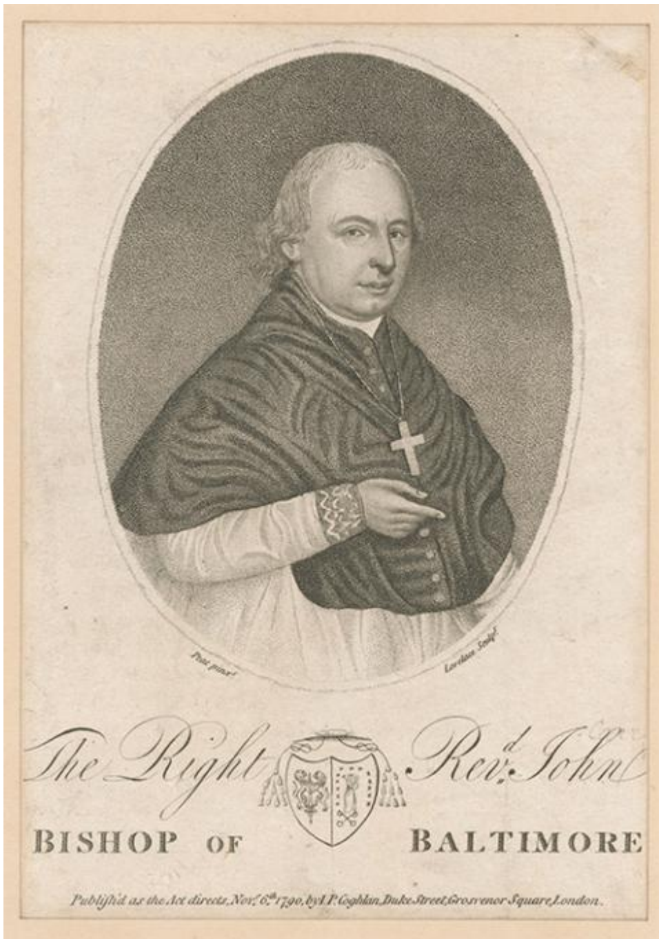
An 18th-century engraving of Bishop John Carroll of Baltimore