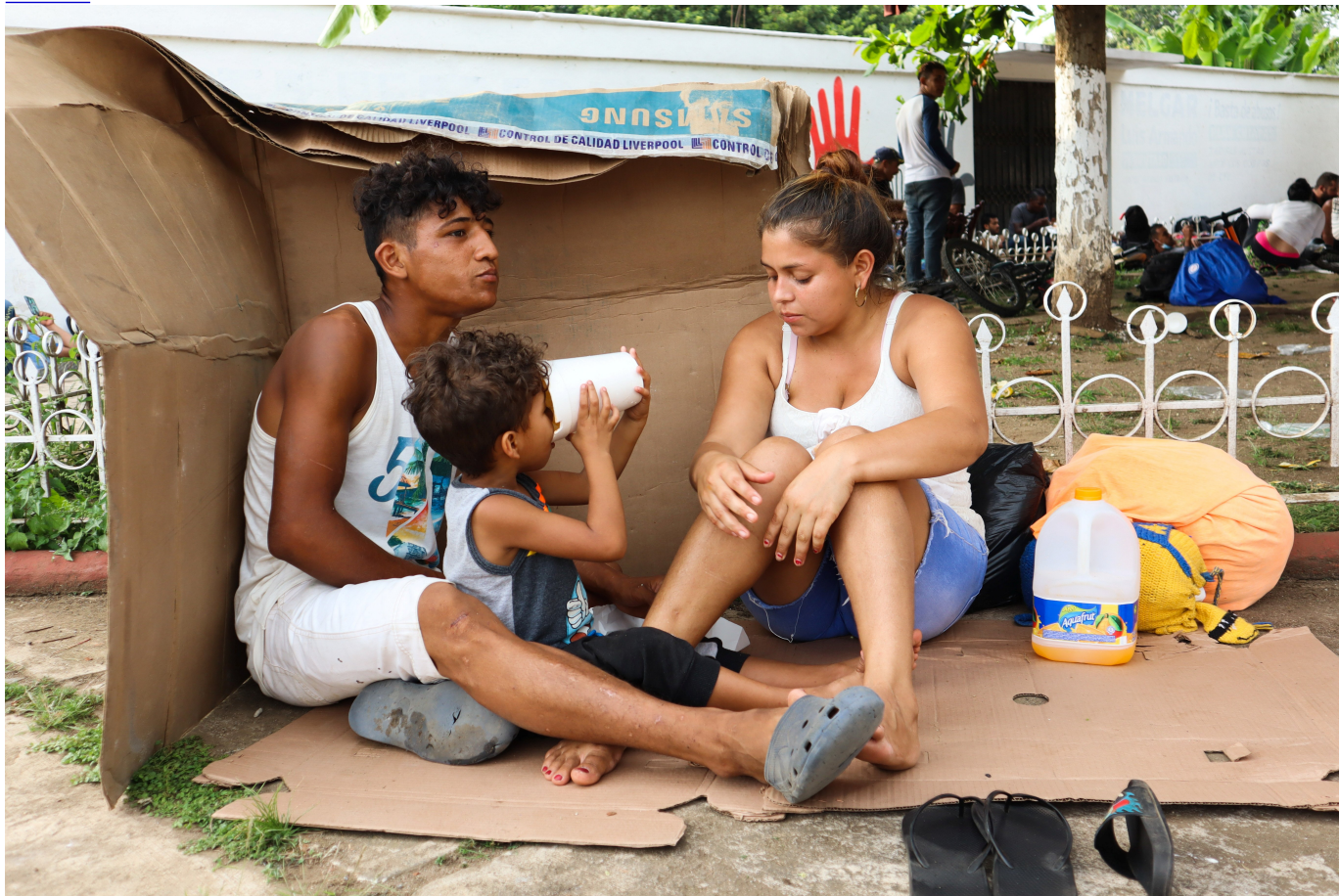
A migrant family in Huehuetán, Mexico, rests at a park with other caravan migrants heading to the U.S. border Nov. 18, 2021.