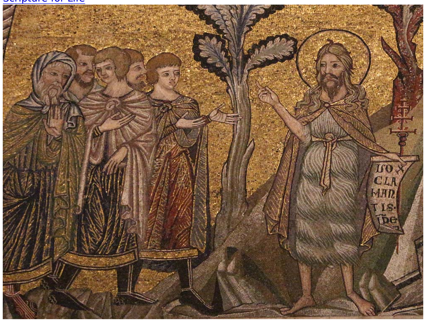
The life of St. John the Baptist is depicted in medieval mosaics at the Baptistery San Giovanni in Florence, Italy.