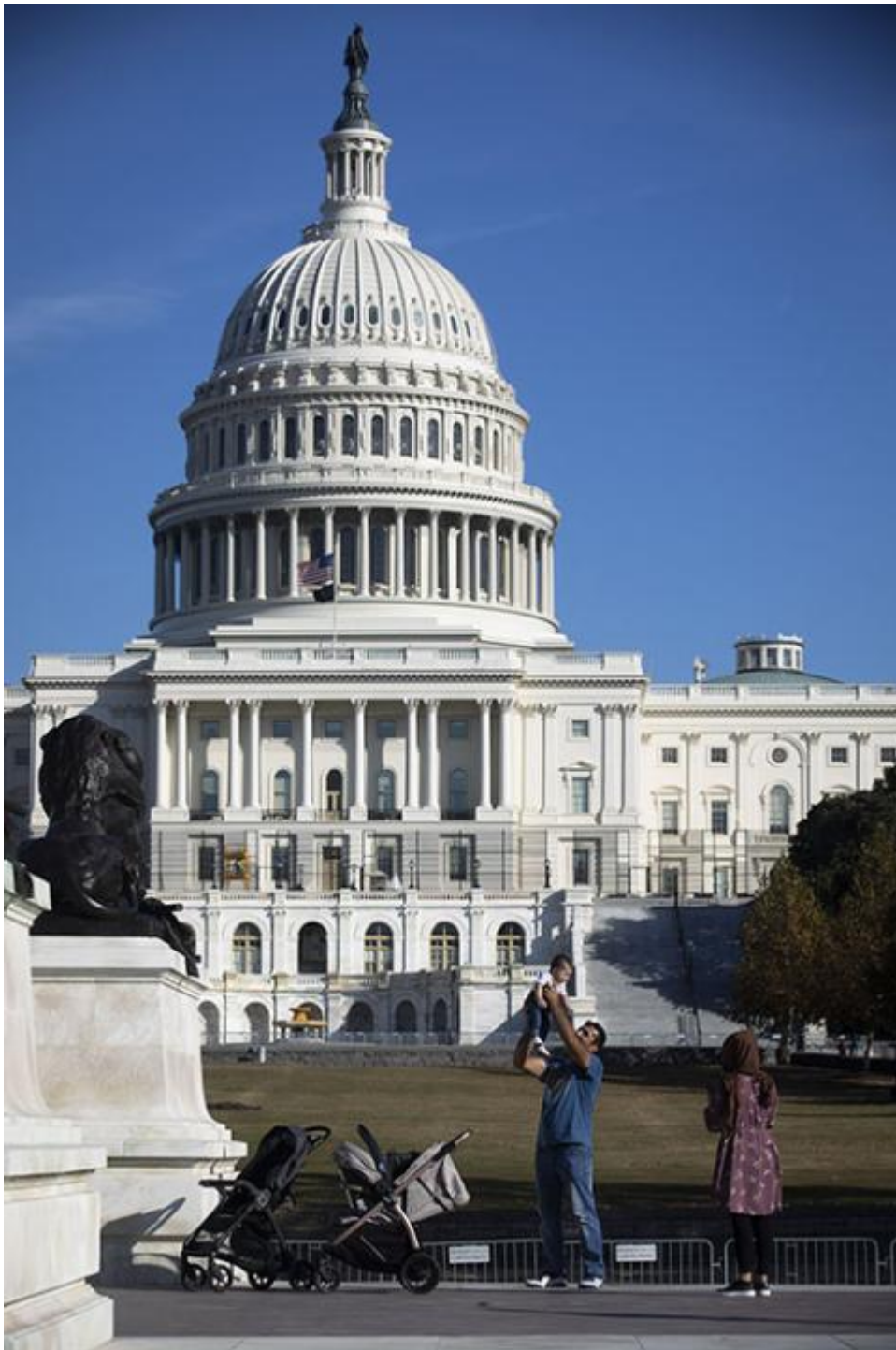
A family is seen near the U.S. Capitol in Washington Nov. 18, 2021.

Over time, I fear the backlash against overturning Roe will be large and consequential, but not necessarily in 2022.