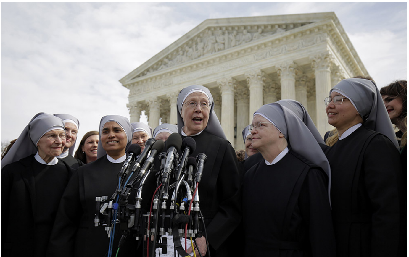
The Denver-based Little Sisters of the Poor speak to the media outside the U.S. Supreme Court in Washington, D.C., in 2016. The Becket Fund represented the sisters in their fight against the Affordable Care Act's contraceptive mandate.