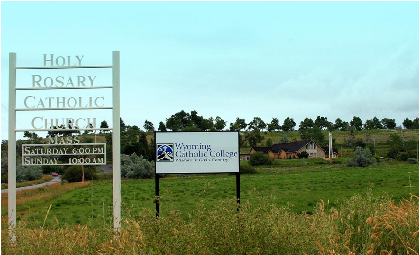
A view of Wyoming Catholic College's campus in Lander