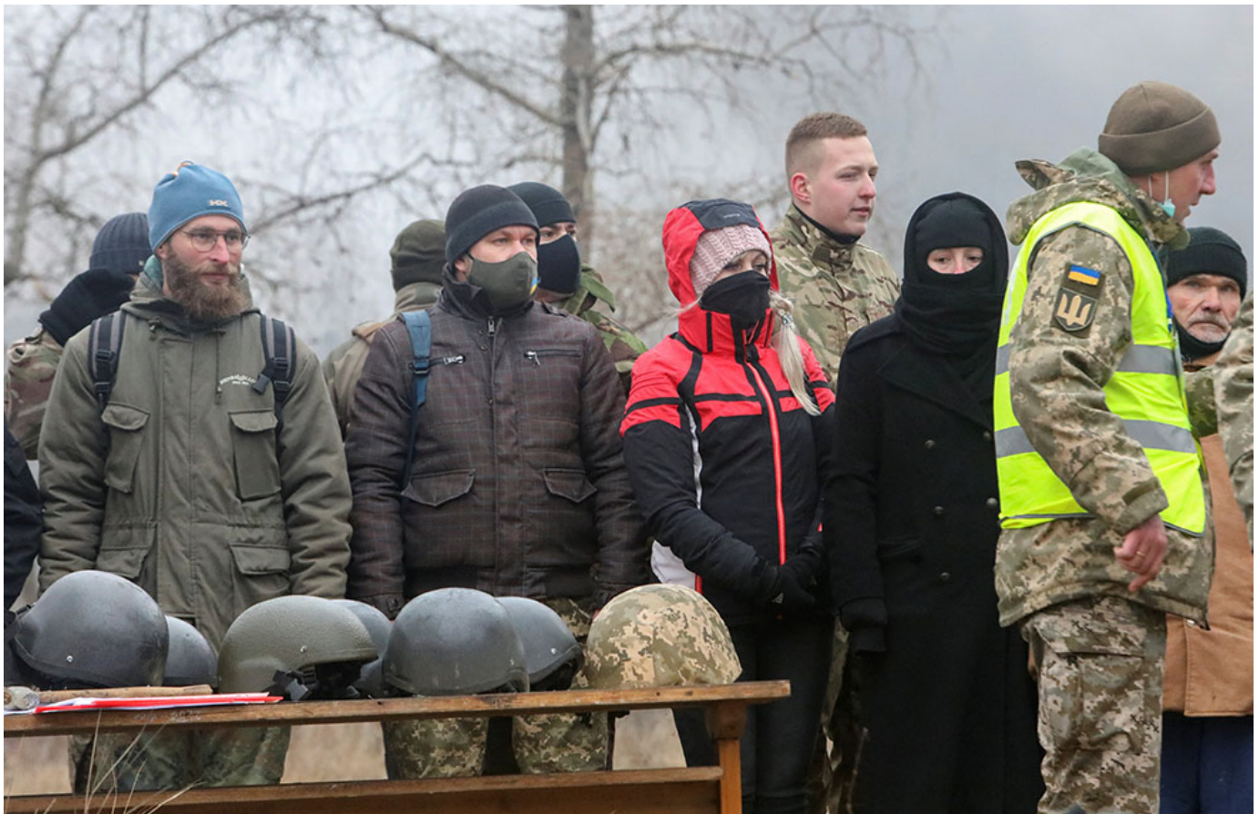
Reservists of the Ukrainian Territorial Defense Forces line up as they take part in military exercises at a training ground outside Kharkiv, Ukraine, Dec. 11, 2021.

Meanwhile, many Catholic parishes would lie in the direct path of a Russian invasion, especially around strategic cities such as Kharkiv and Odessa.