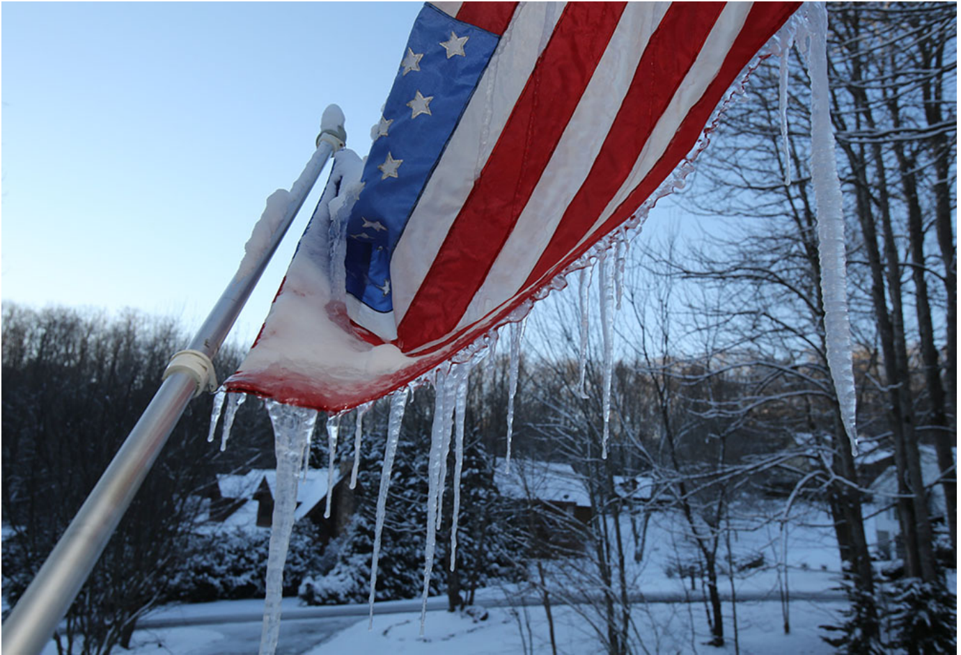
Icicles hang from a frozen U.S. flag on the front porch of a home in Waynesville, North Carolina, Dec. 26, 2020.