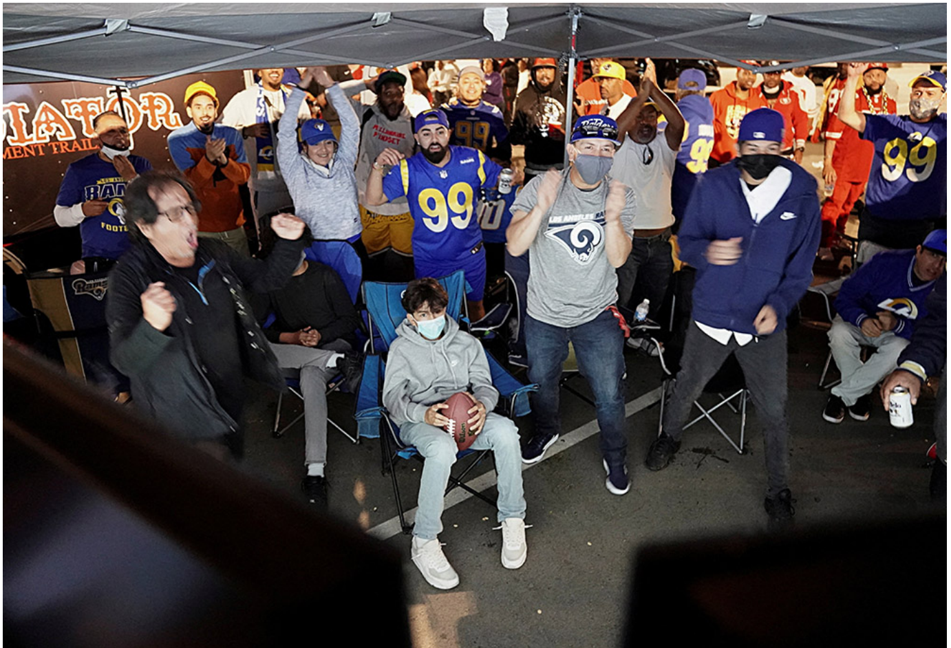
Los Angeles Rams fans at a tailgate party in the SoFi Stadium parking lot in Inglewood, California, celebrate the team's victory over the San Francisco 49ers in the NFC Championship game Jan. 30, 2022, amid the coronavirus pandemic.

I have long found the idea of simply quitting any attention to football as a frustrating lack of commitment to any growth. Withdrawing from football fandom is tantamount to doing nothing. A Catholic dedication to shifting football culture through your voice to whatever team you support contributes to a culture of positive change.