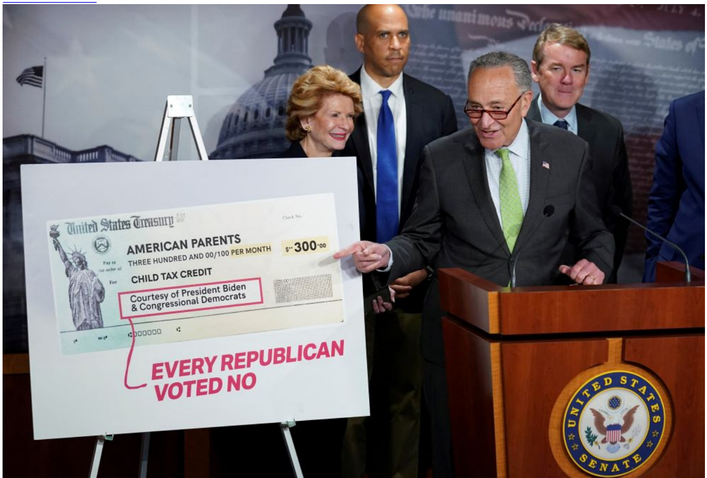
U.S. Senate Majority Leader Chuck Schumer, D-N.Y., holds a news conference at the U.S. Capitol in Washington, D.C., July 15, 2021, about expanded child tax credit payments.