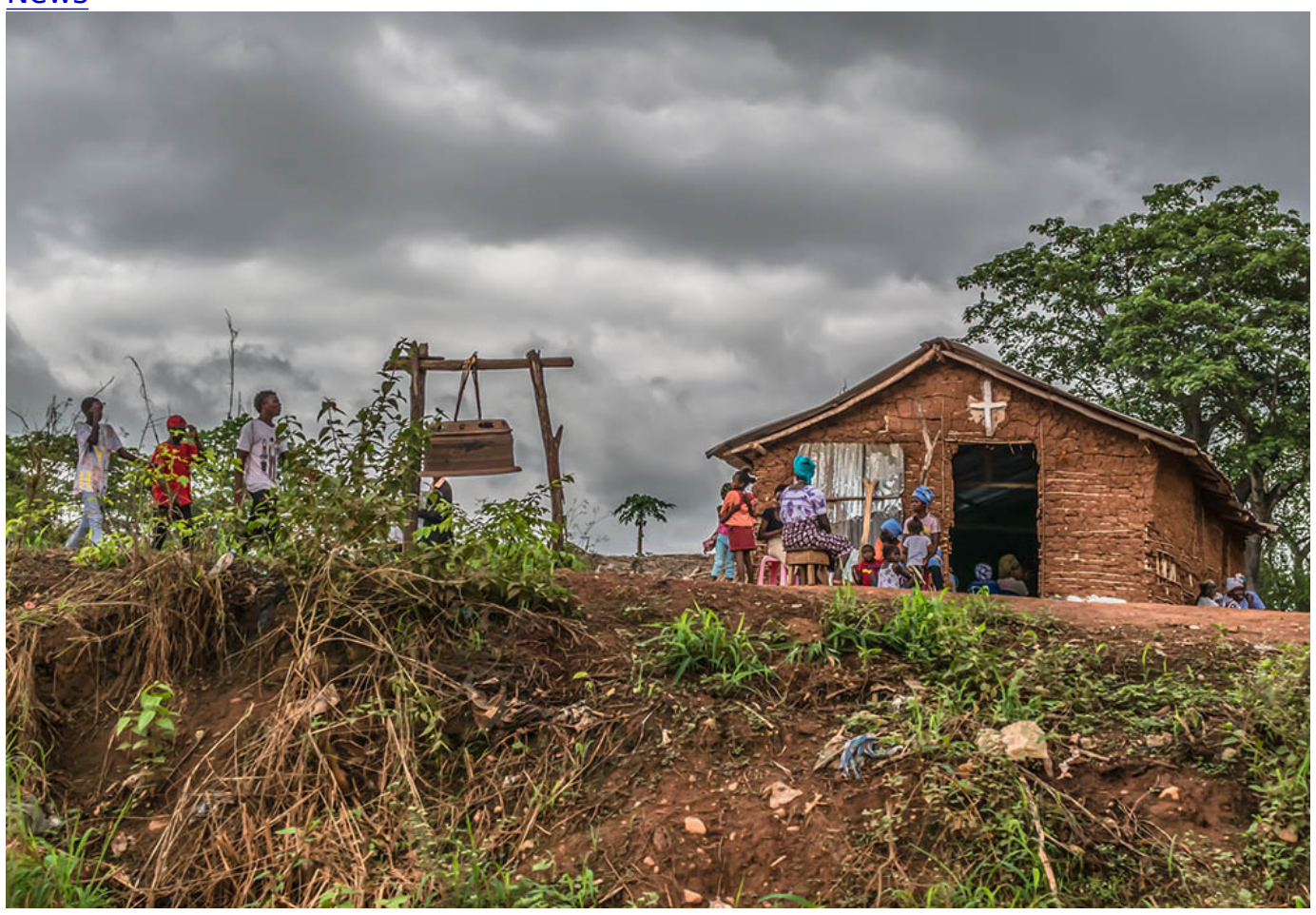
People outside a Catholic church in a village in Malanje Province, Angola, in 2018