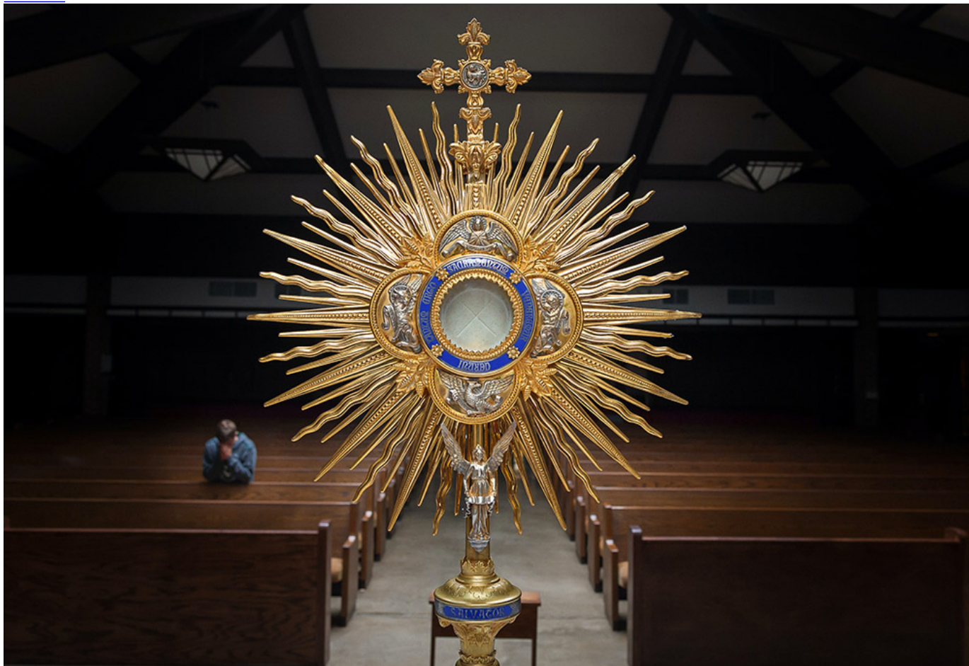
A monstrance holds the Eucharist at a church in Colorado.