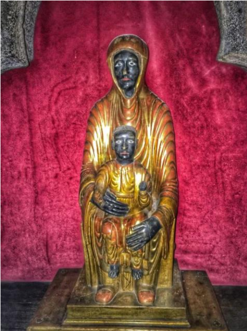
A detail from Our Lady of the Good Death at the Cathedral of Our Lady of the Assumption of Clermont-Ferrand, France

frame God not only as male but as specifically a white male? How does that perception of God shape our perception of one another? Of ourselves? Of our own value? How do those of us who are neither white nor male see ourselves as made in the image of God when surrounded by societal cues telling us that He is not of, with or for us? And how does the concept of a white male God impact those with privilege?