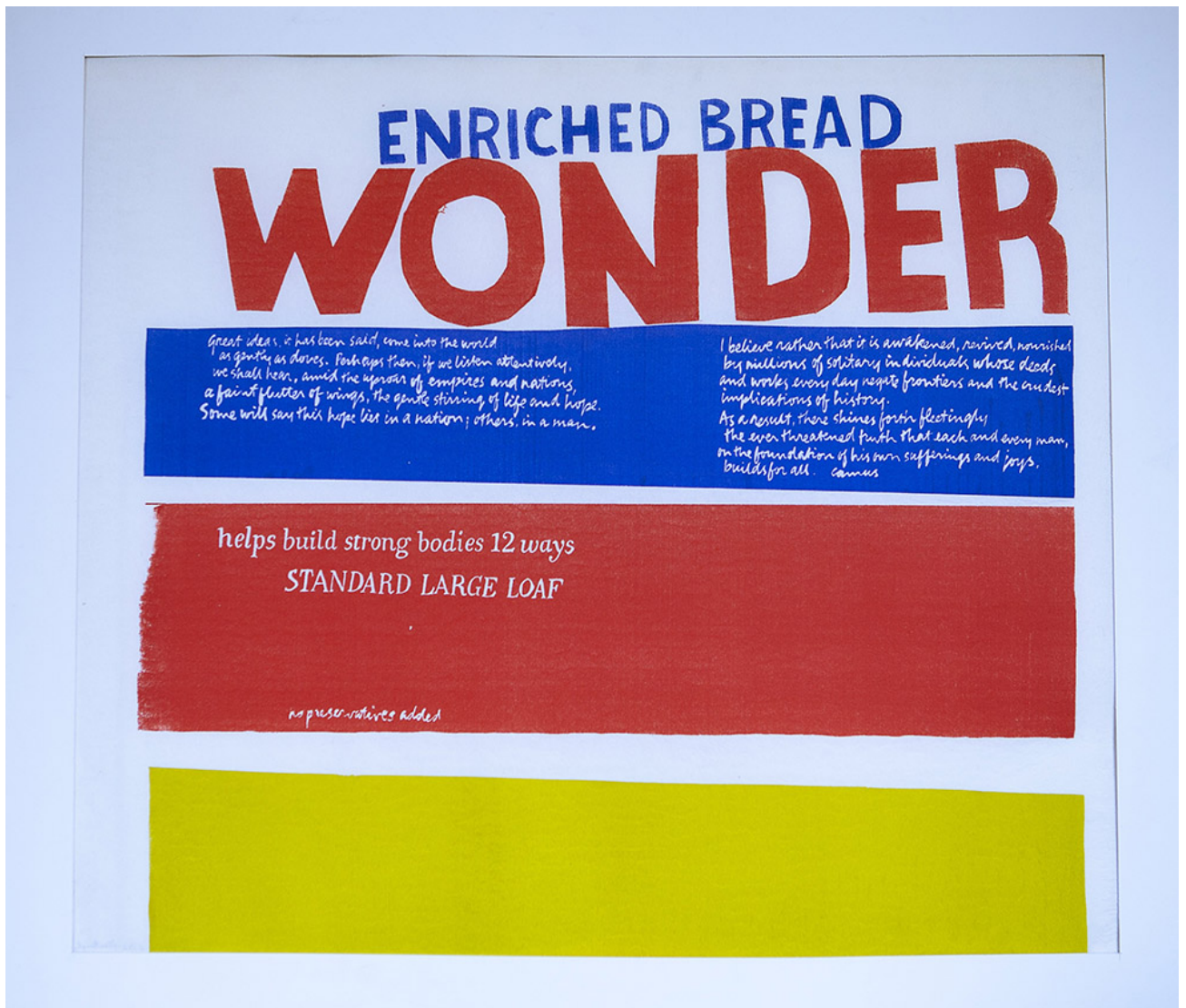
Sr. Corita Kent's 1965 work "Enriched Bread" is seen Feb 17 at the Theological College in Washington.