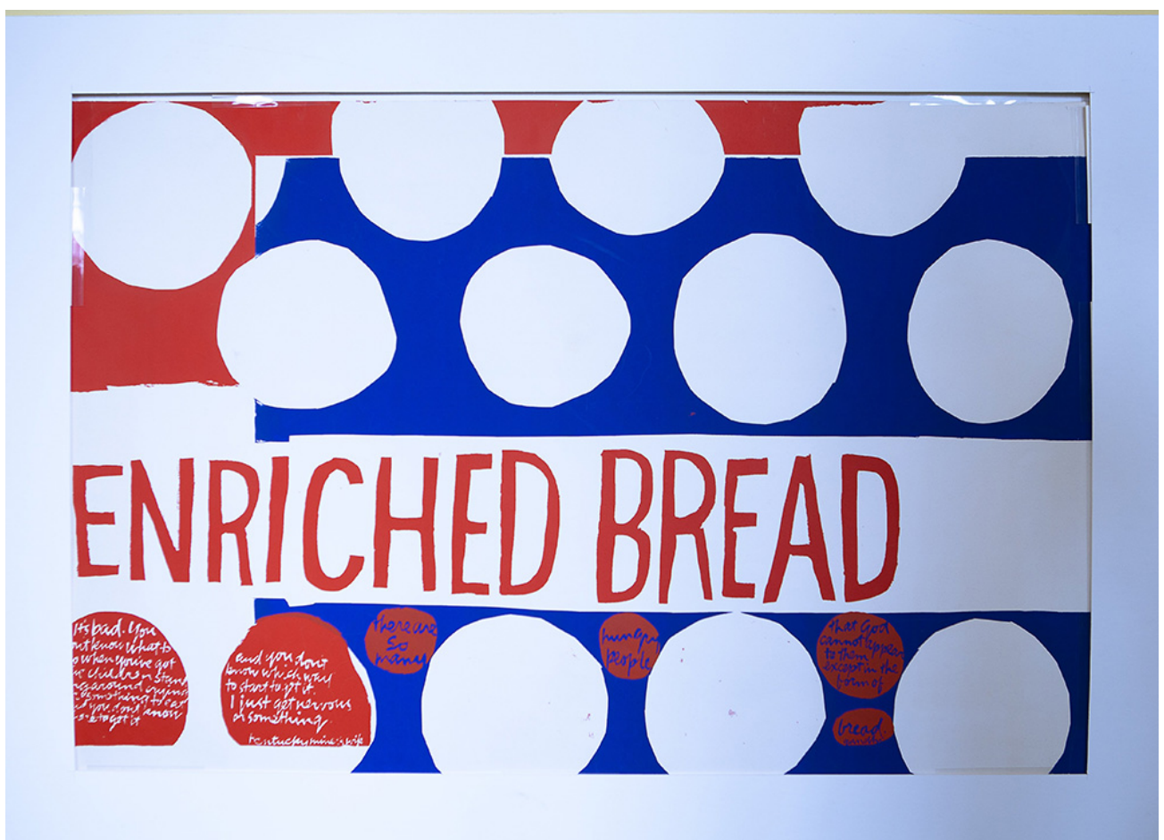
Sr. Corita Kent's 1964 work "That They May Have Life" is seen Feb. 17 at the Theological College in Washington.