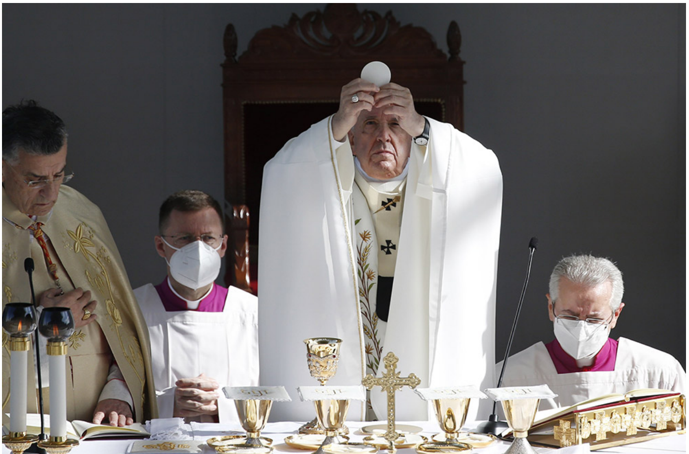
Pope Francis elevates the Eucharist as he celebrates Mass at the GSP Stadium in Nicosia, Cyprus, Dec. 3, 2021.